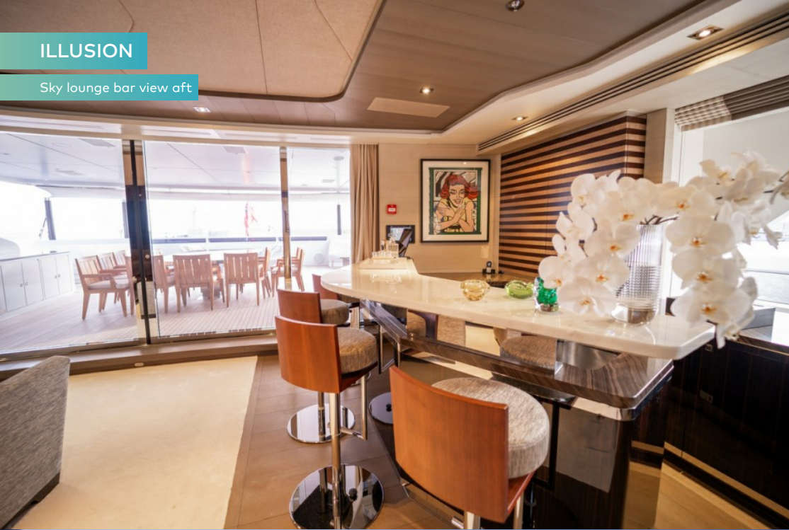
Sky lounge bar view aft