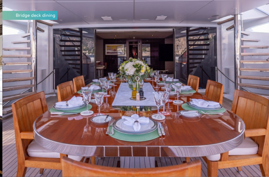
Bridge deck dining