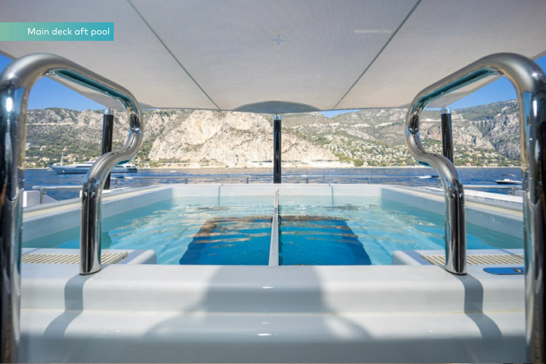
Main deck aft pool