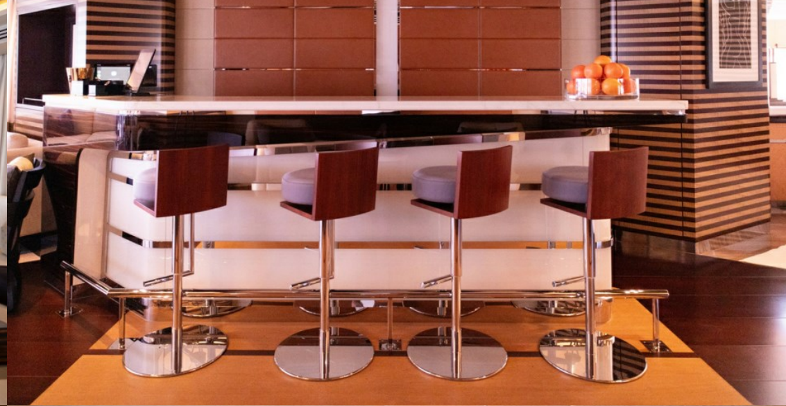
Main deck bar