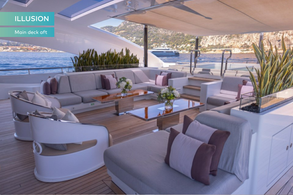
Main deck aft