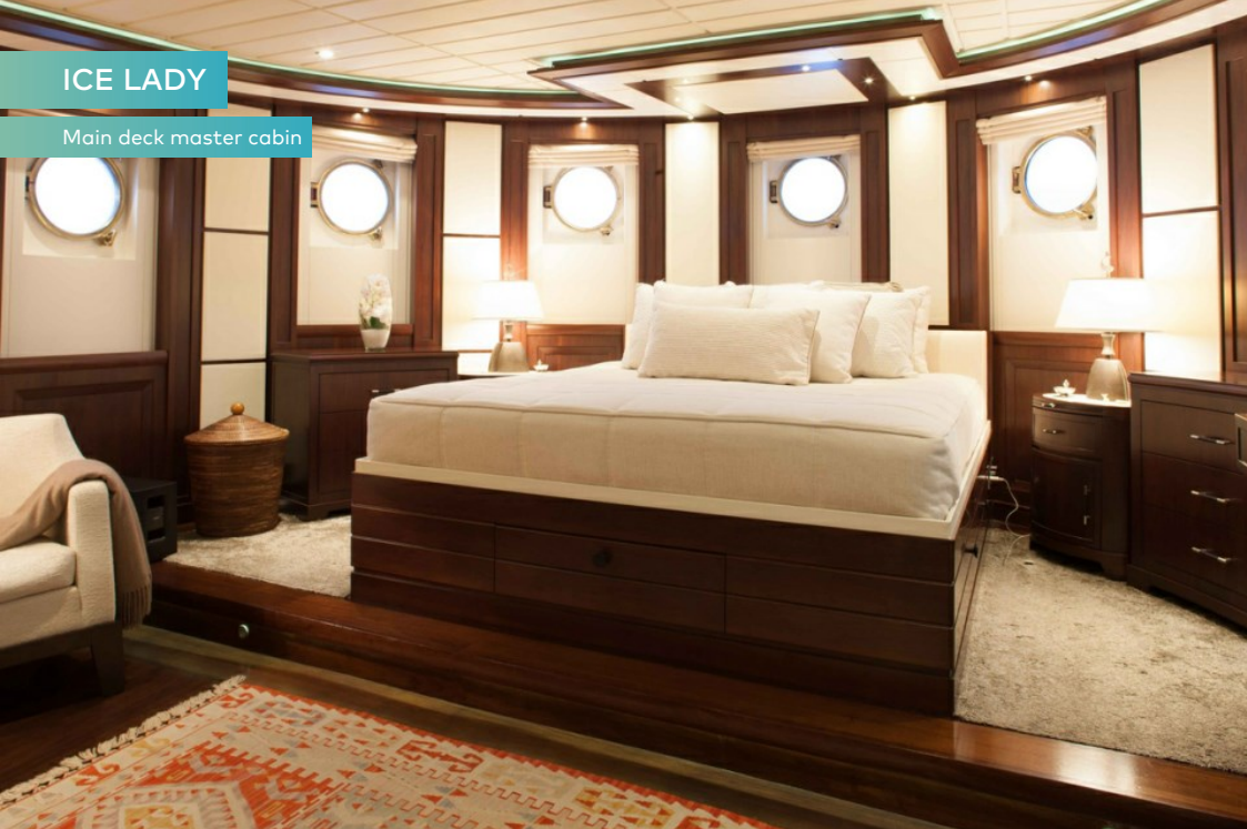
Main deck master cabin