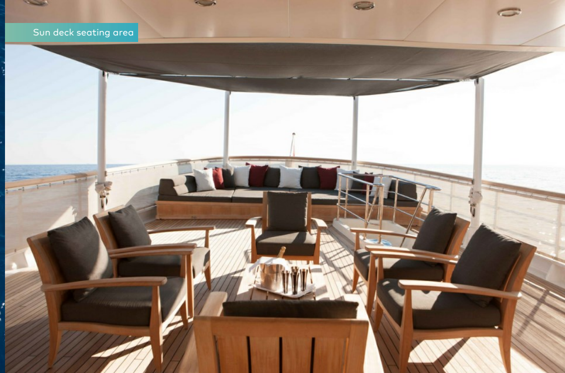
Sun deck seating area