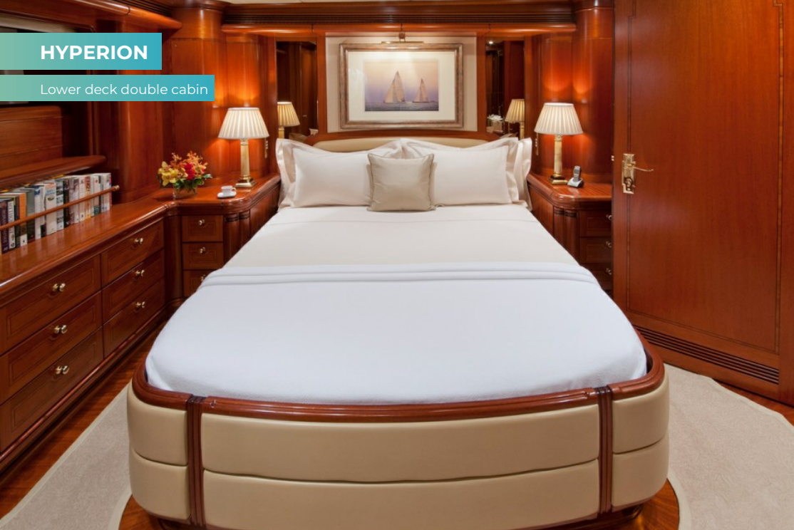
Lower deck double cabin