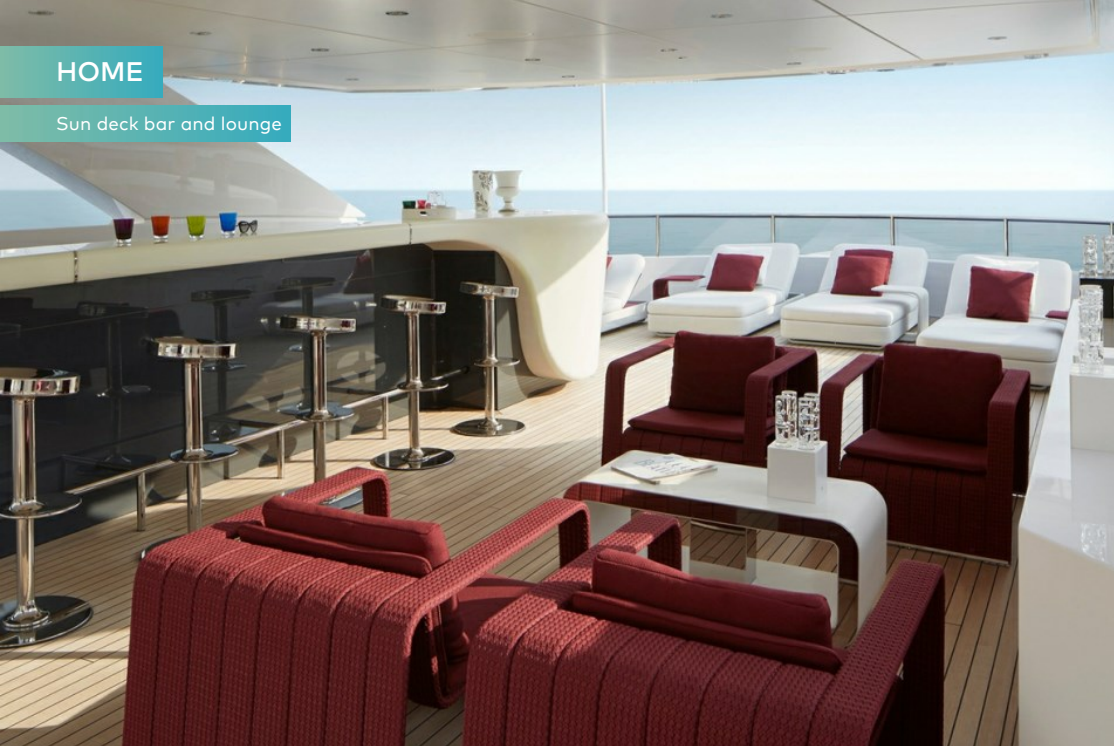
Sun deck bar and lounge