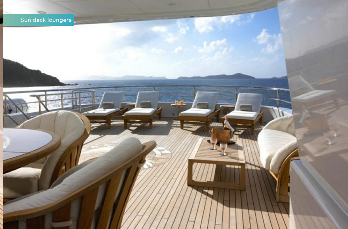
Sun deck loungers