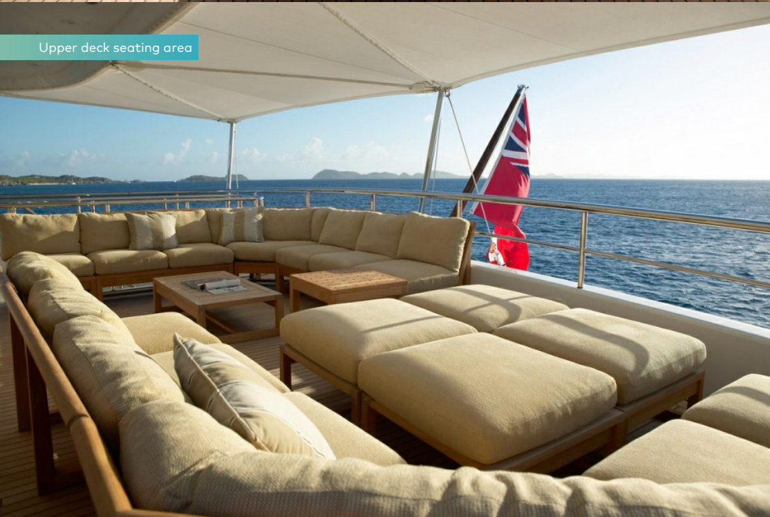
Upper deck seating area