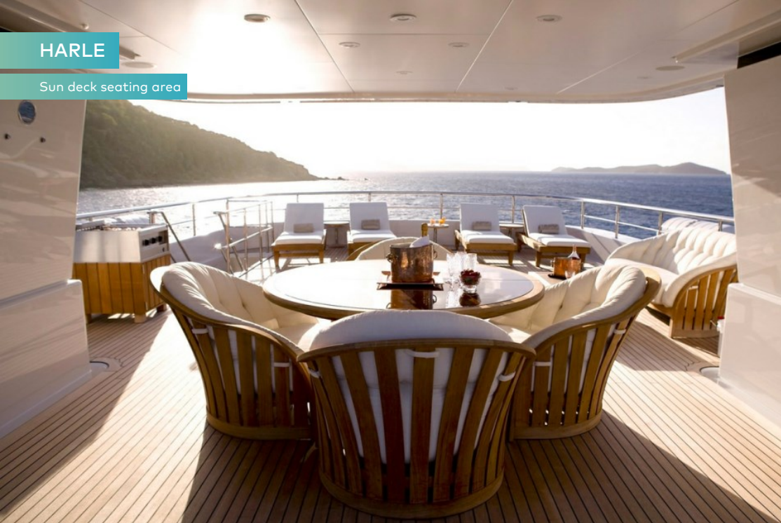
Sun deck seating area