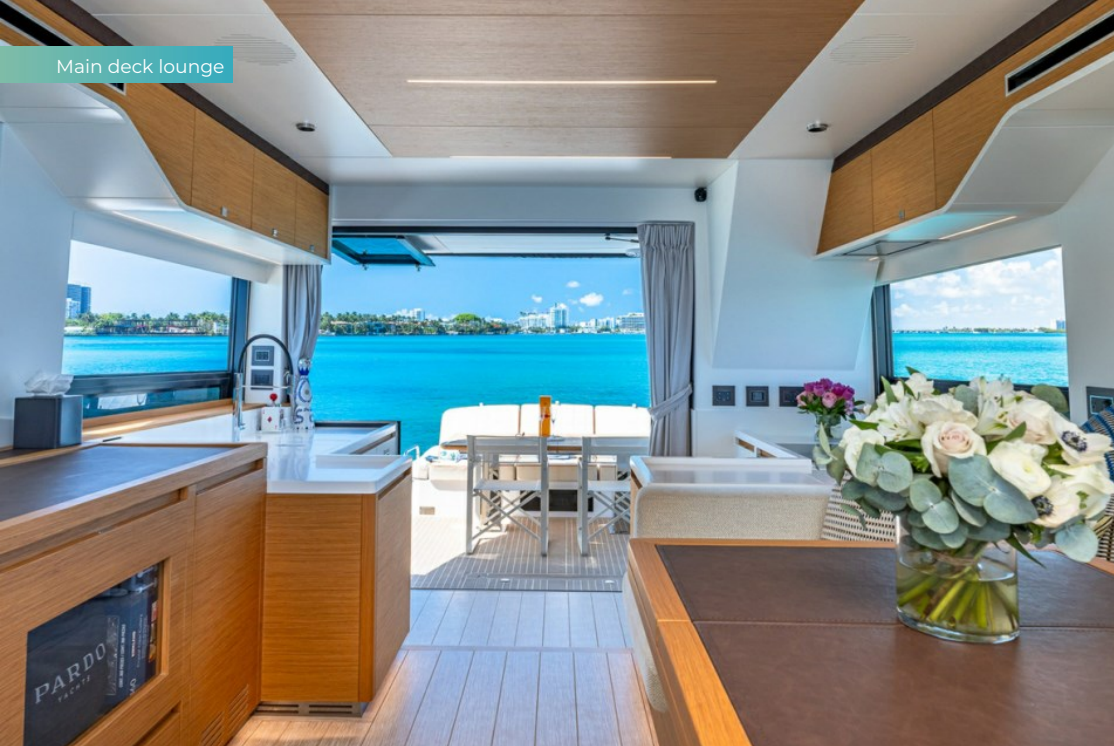
Main deck lounge