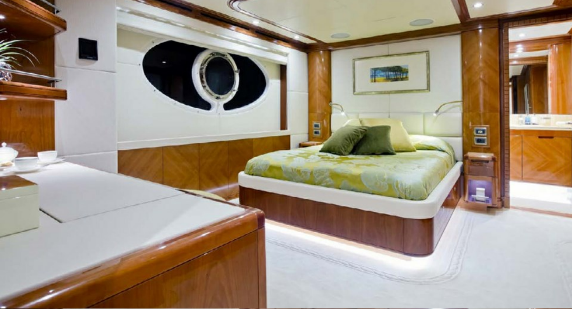
Lower deck double cabin