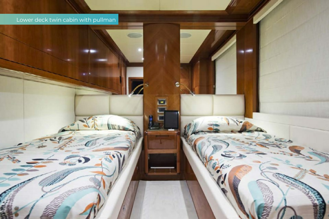
Lower deck twin cabin with pullman