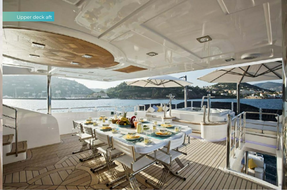
Upper deck aft