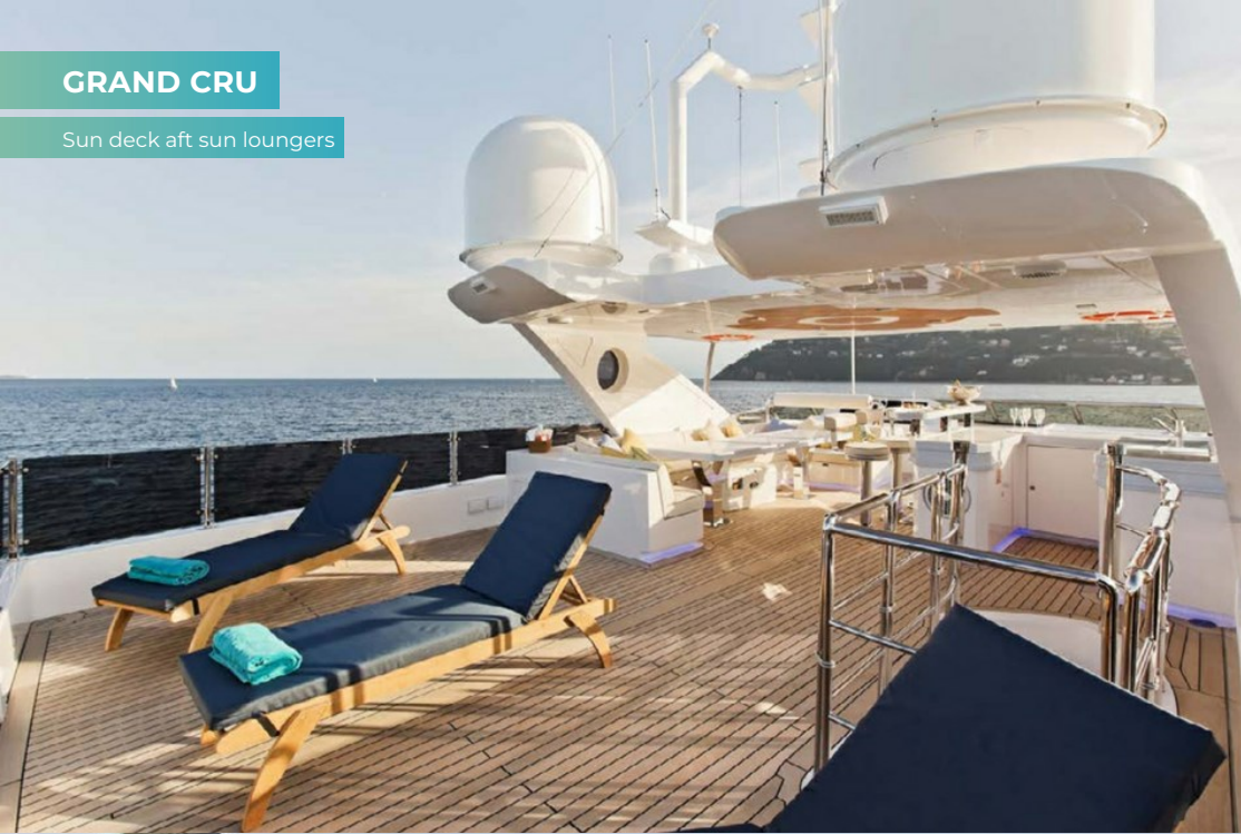
Sun deck aft sun loungers