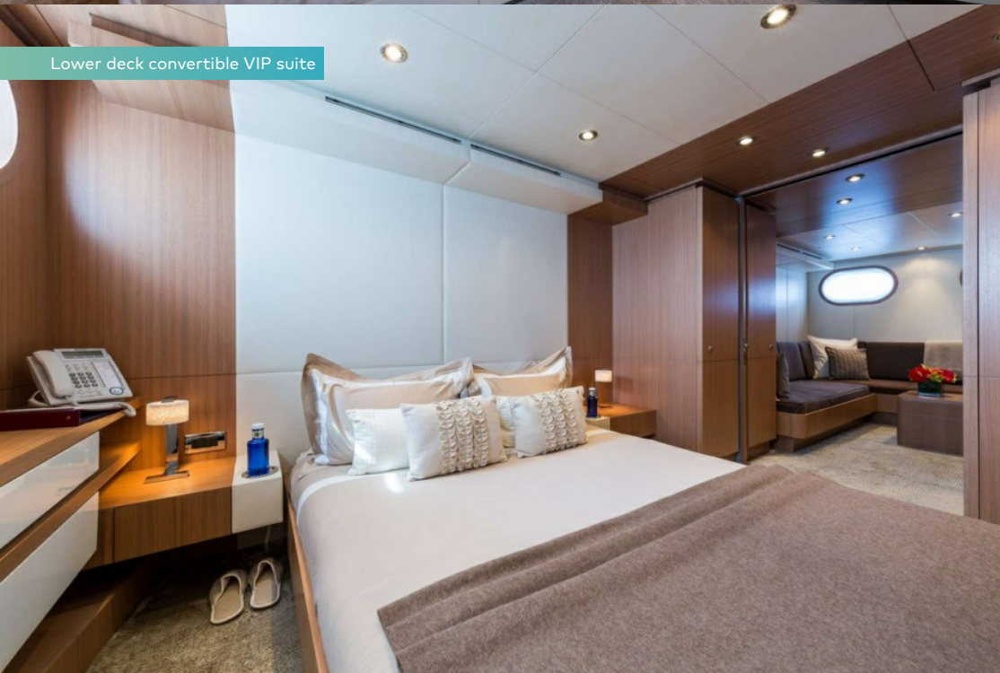
Lower deck convertible VIP suite