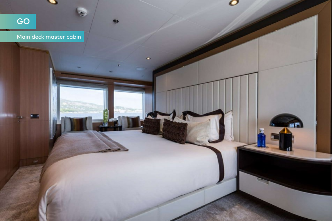
Main deck master cabin