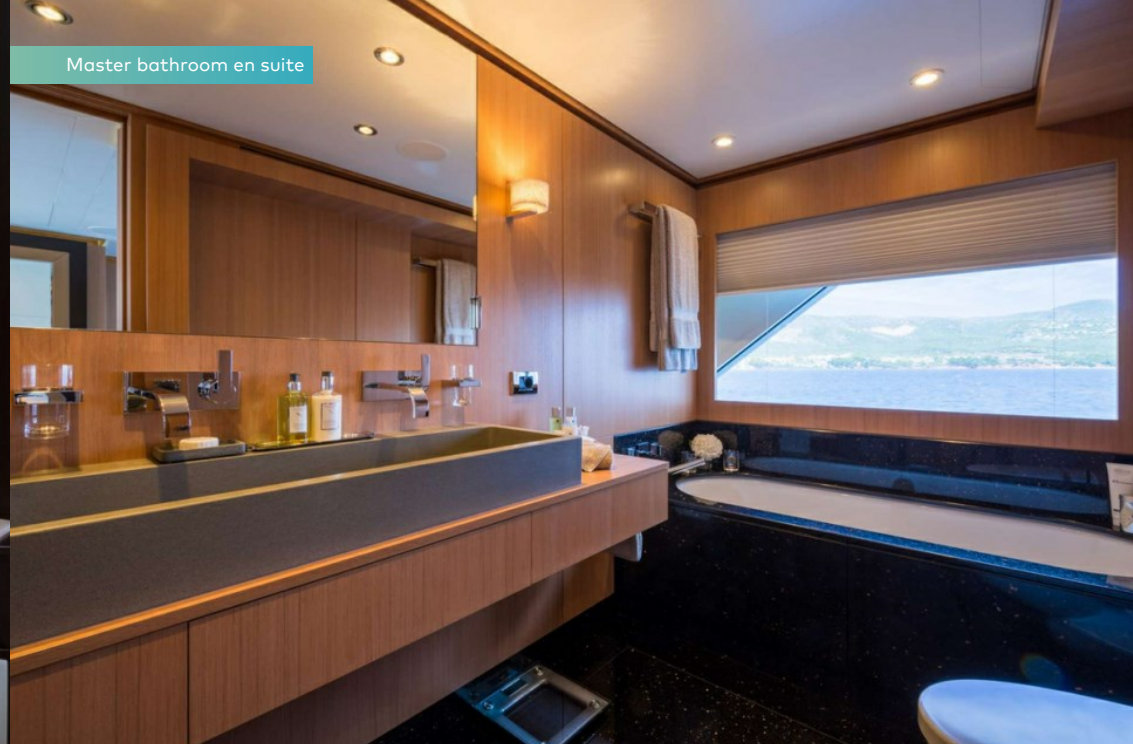
Master bathroom en suite