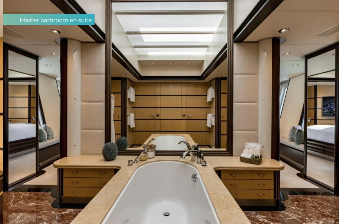
Master bathroom en suite