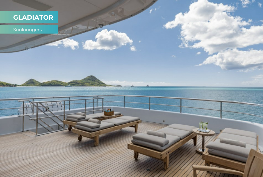
Upper deck aft