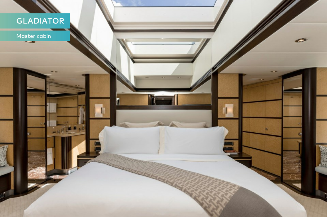
Master cabin en suite bathroom