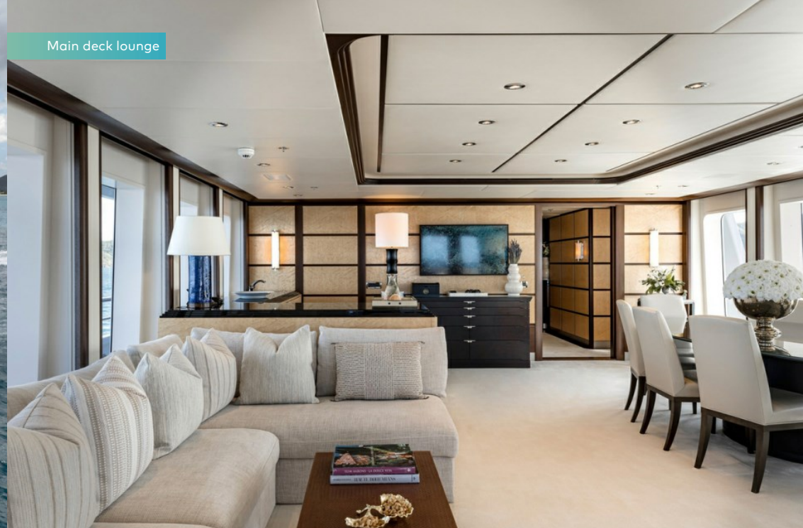
Main deck lounge