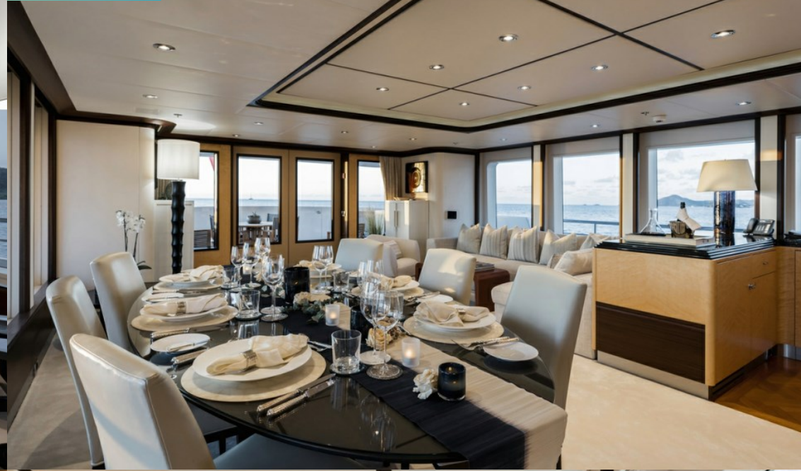
Main deck dining