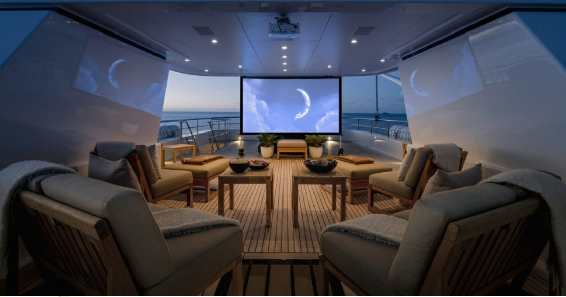
Sun deck cinema set up