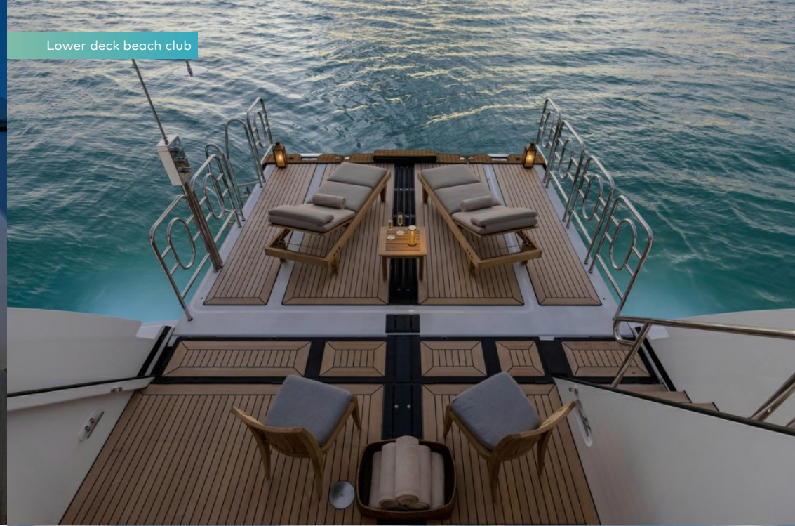
Lower deck beach club