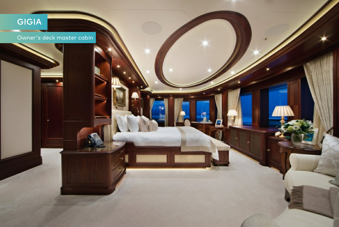
Owner's deck master cabin