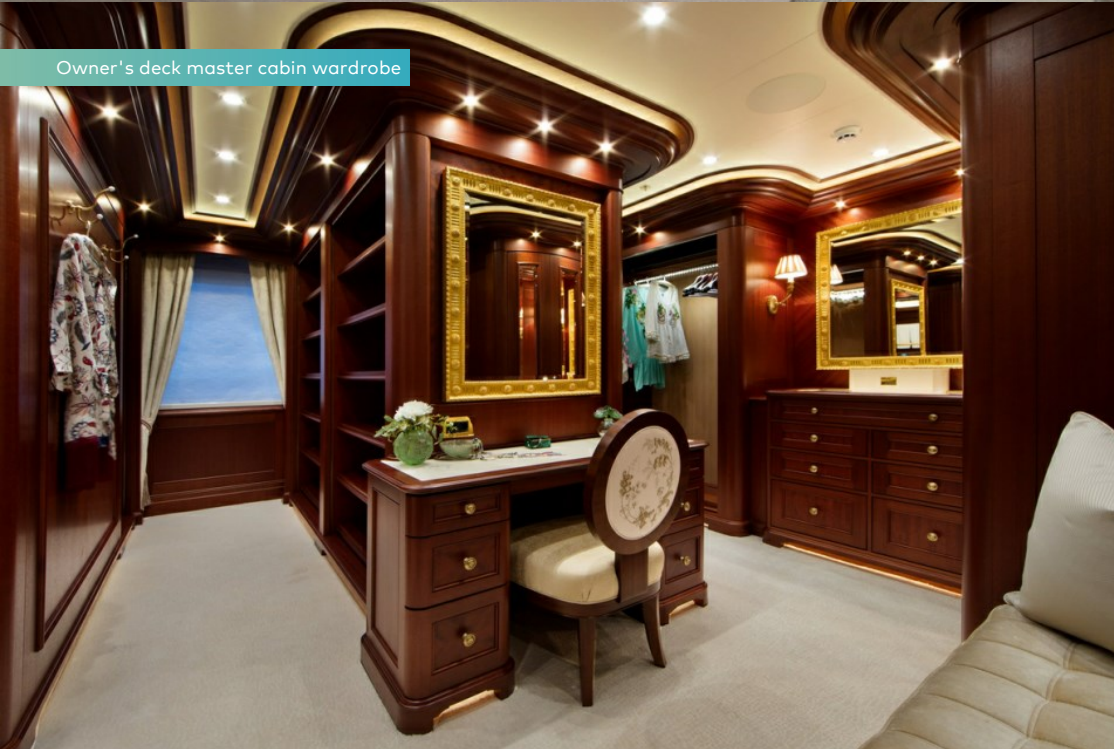
Owner's deck master cabin wardrobe