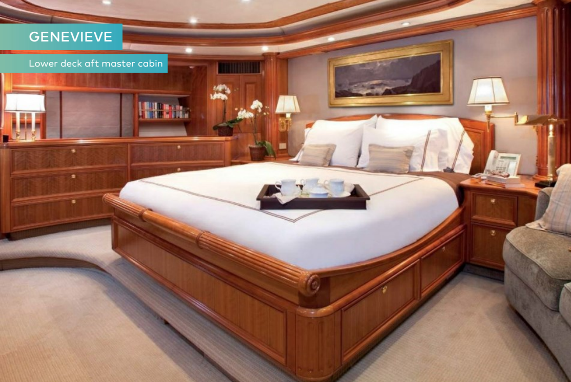
Lower deck aft master cabin