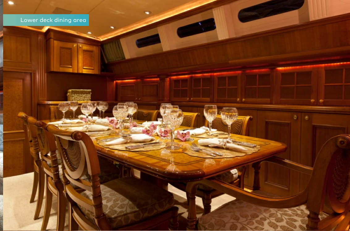
Lower deck dining area