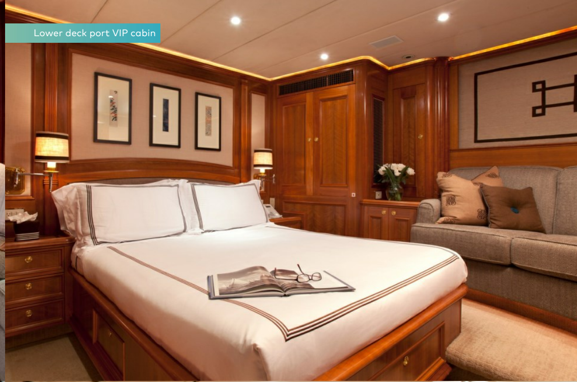
Lower deck port VIP cabin