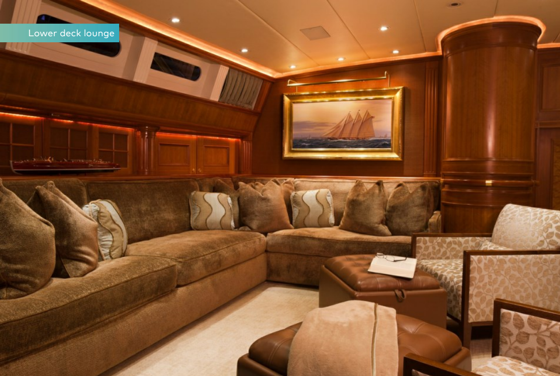
Lower deck lounge