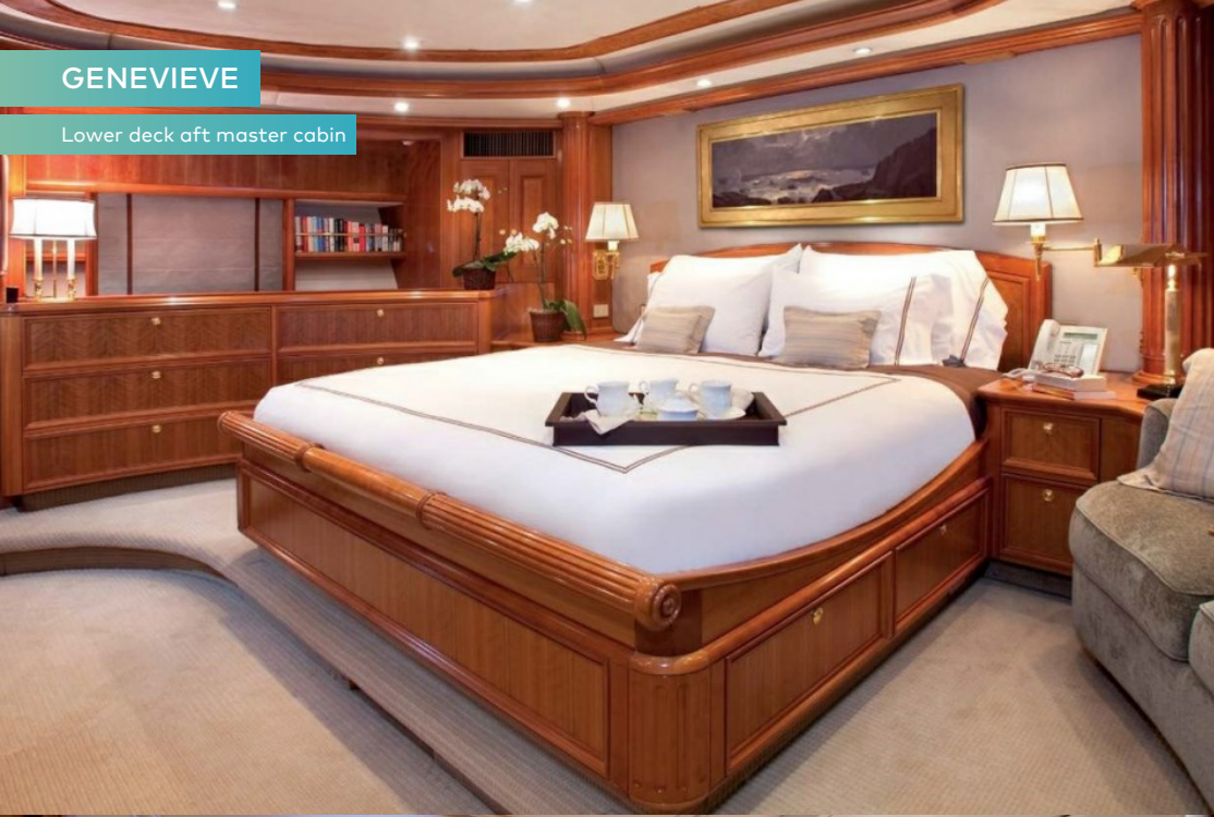
Lower deck aft master cabin