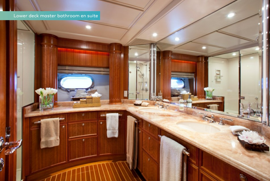
Lower deck master bathroom en suite