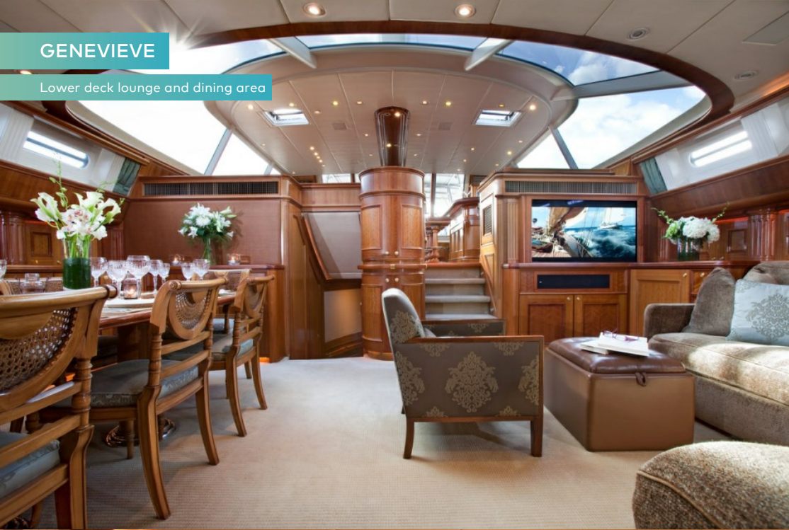
Lower deck lounge and dining area