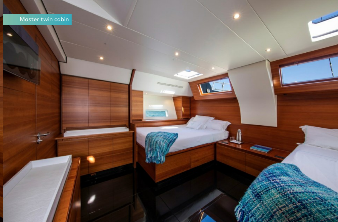
Master twin cabin