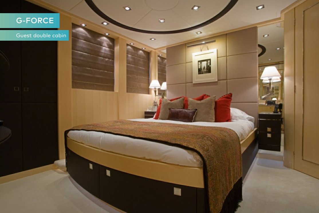
Guest double cabin