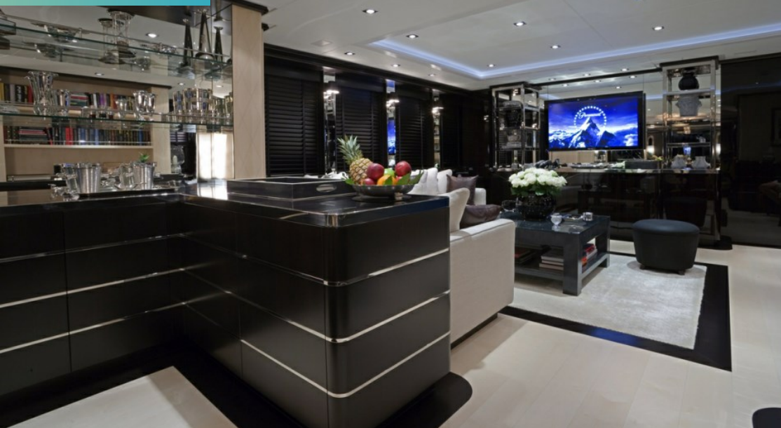
Main deck lounge and bar