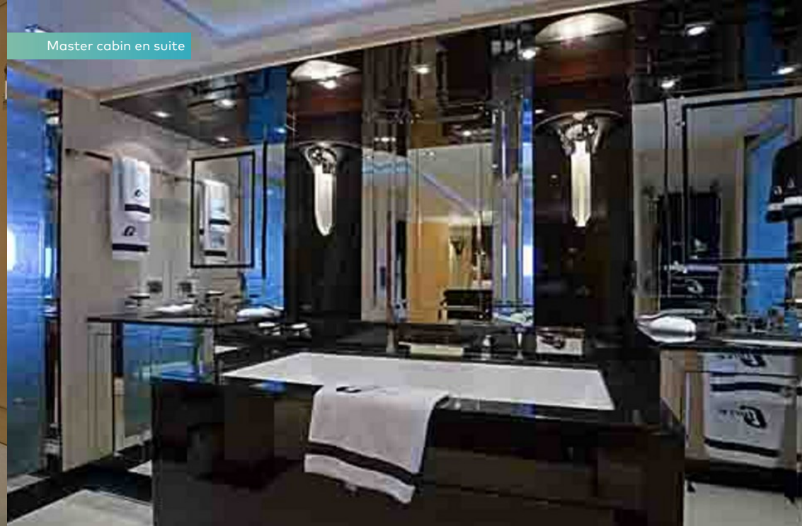
Master cabin en suite