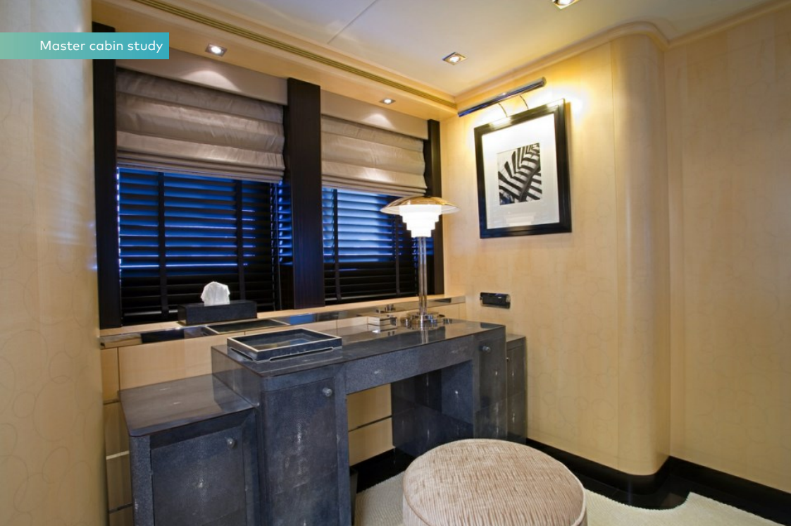
Master cabin study