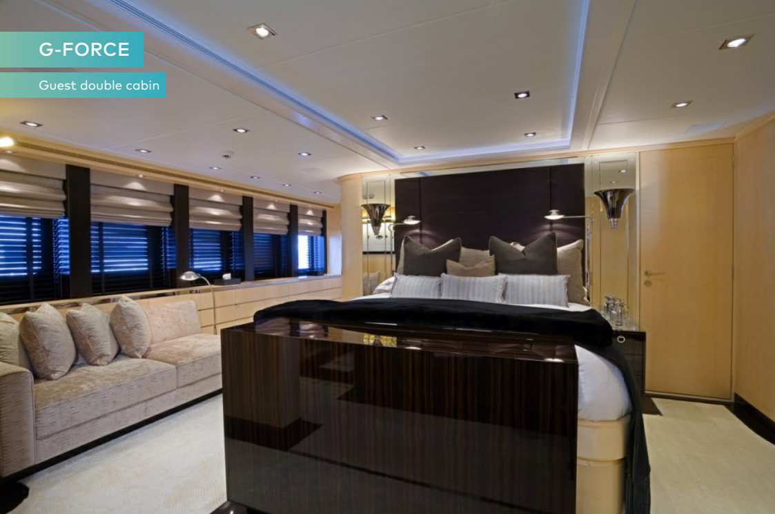
Guest double cabin