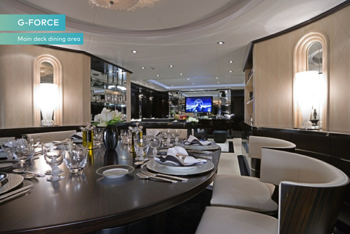
Main deck dining area