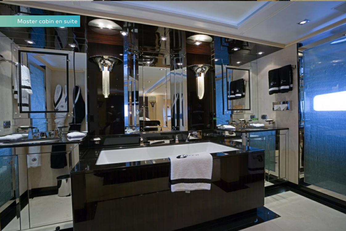
Master cabin en suite