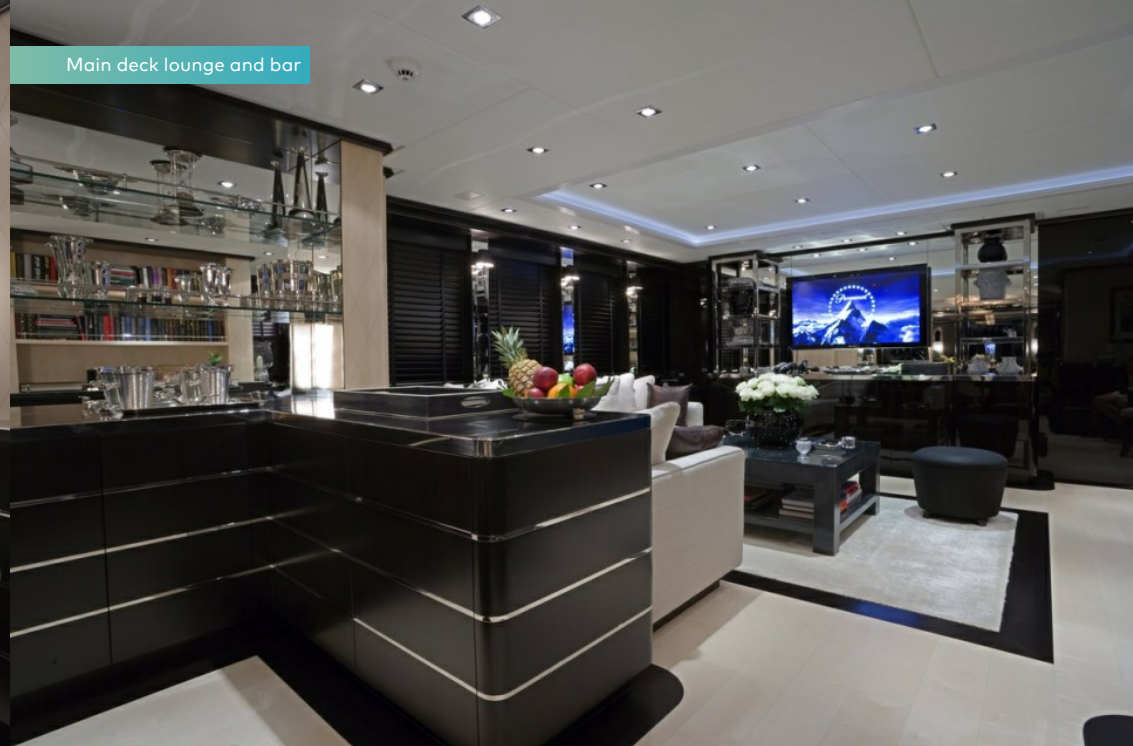
Main deck lounge and bar