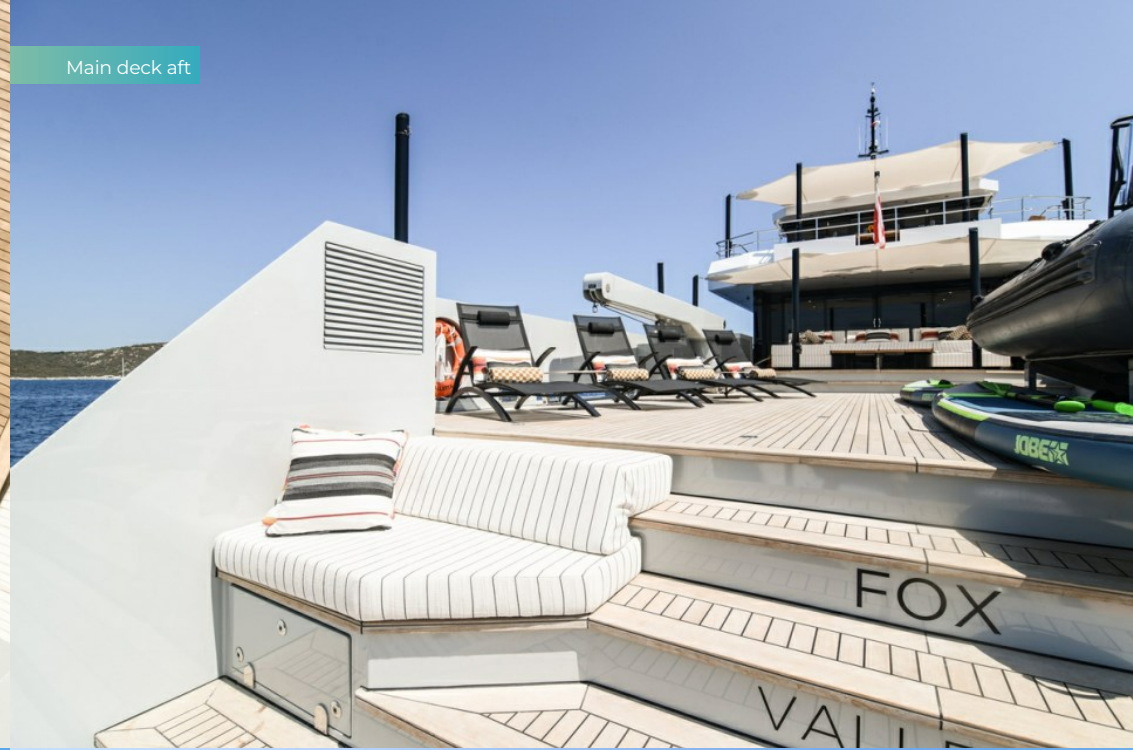
Main deck aft