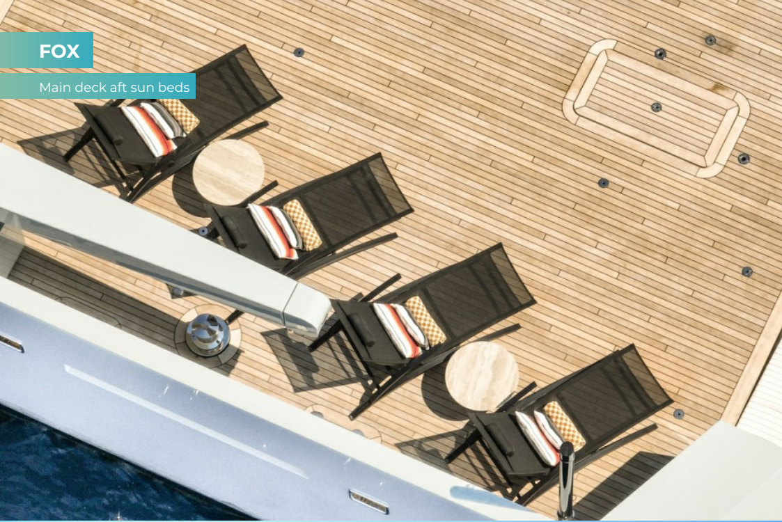
Main deck aft sun beds