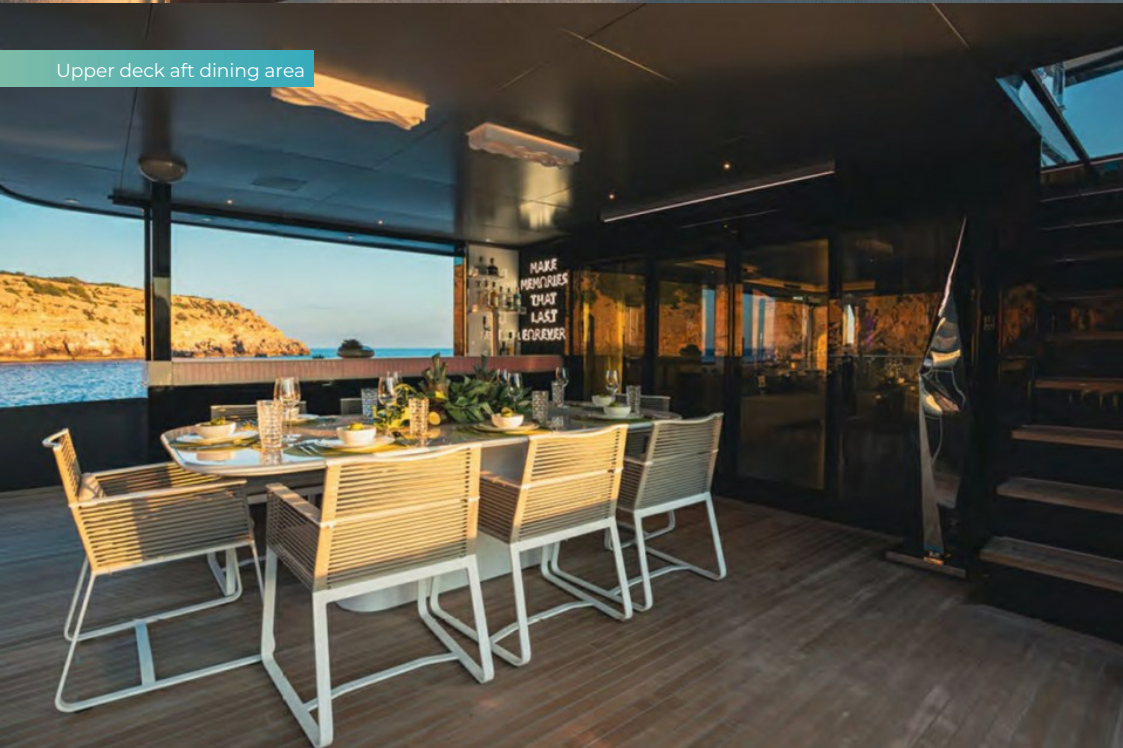
Upper deck aft dining area