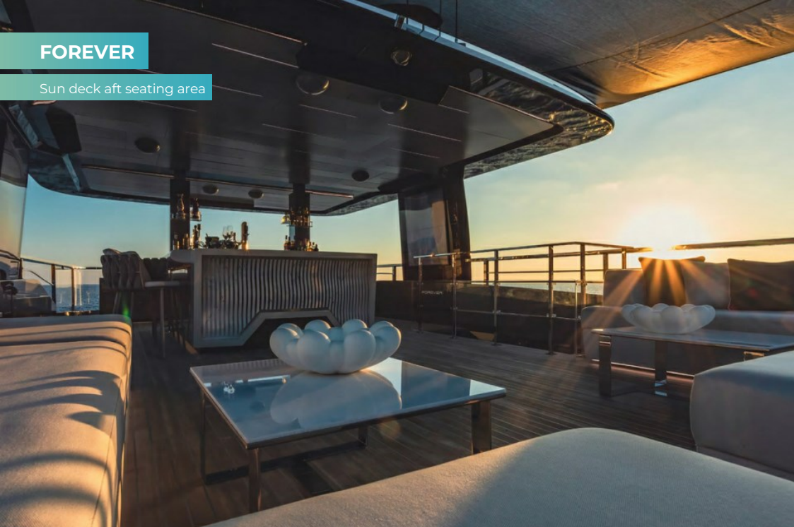
Sun deck aft seating area