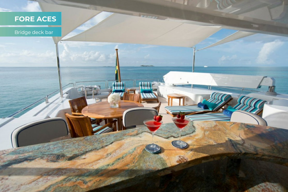
Bridge deck bar