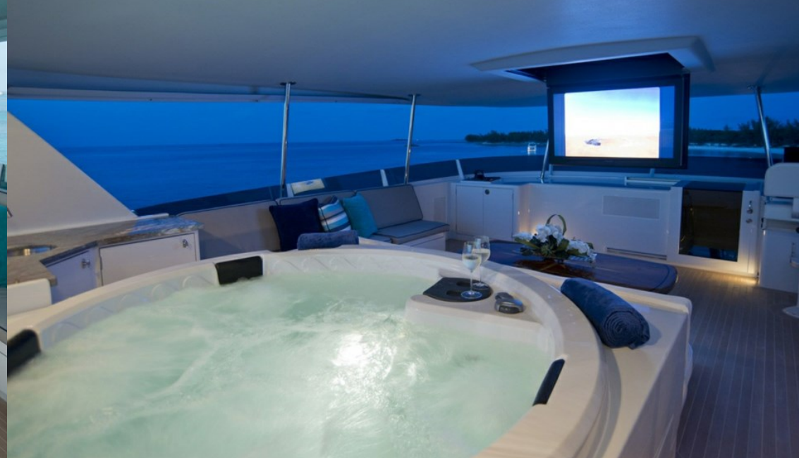
Sun deck jacuzzi