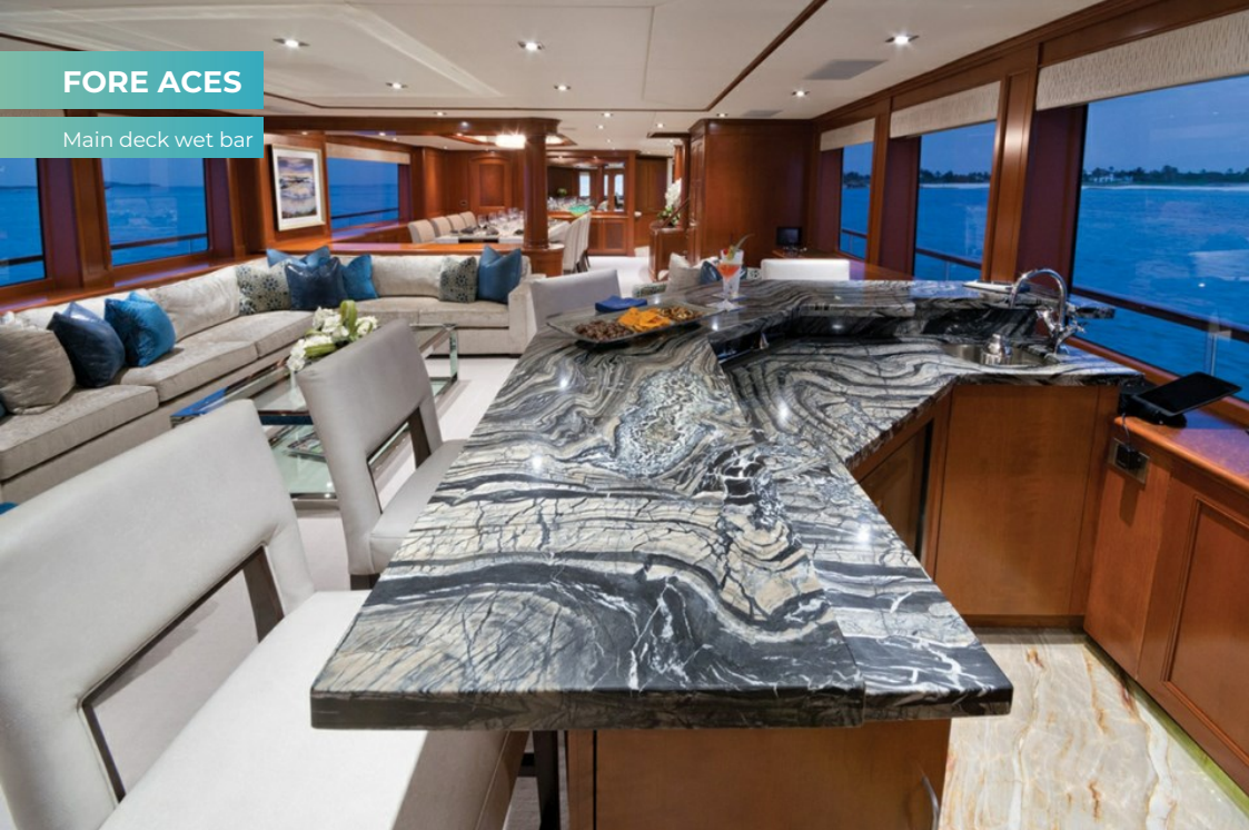
Main deck wet bar