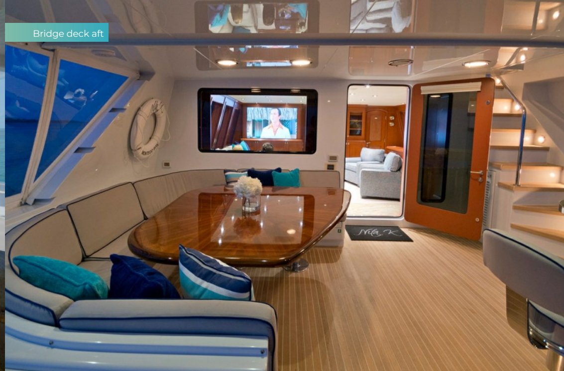
Bridge deck aft