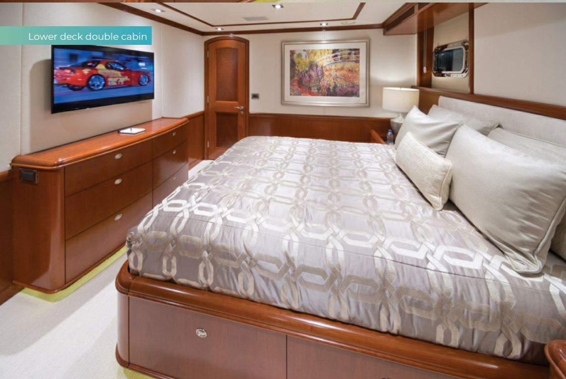
Lower deck double cabin