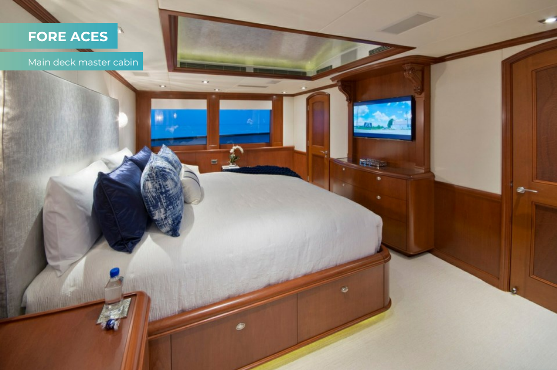
Main deck master cabin