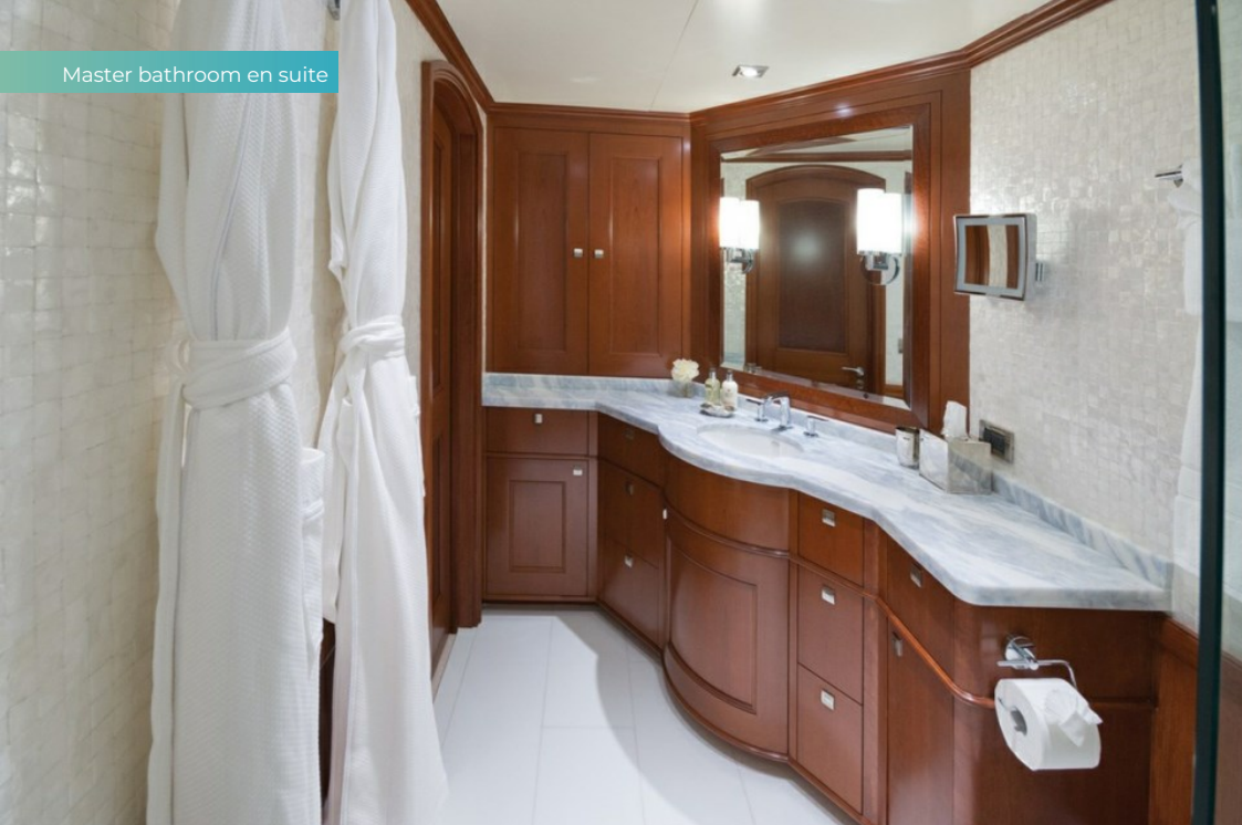
Master bathroom en suite