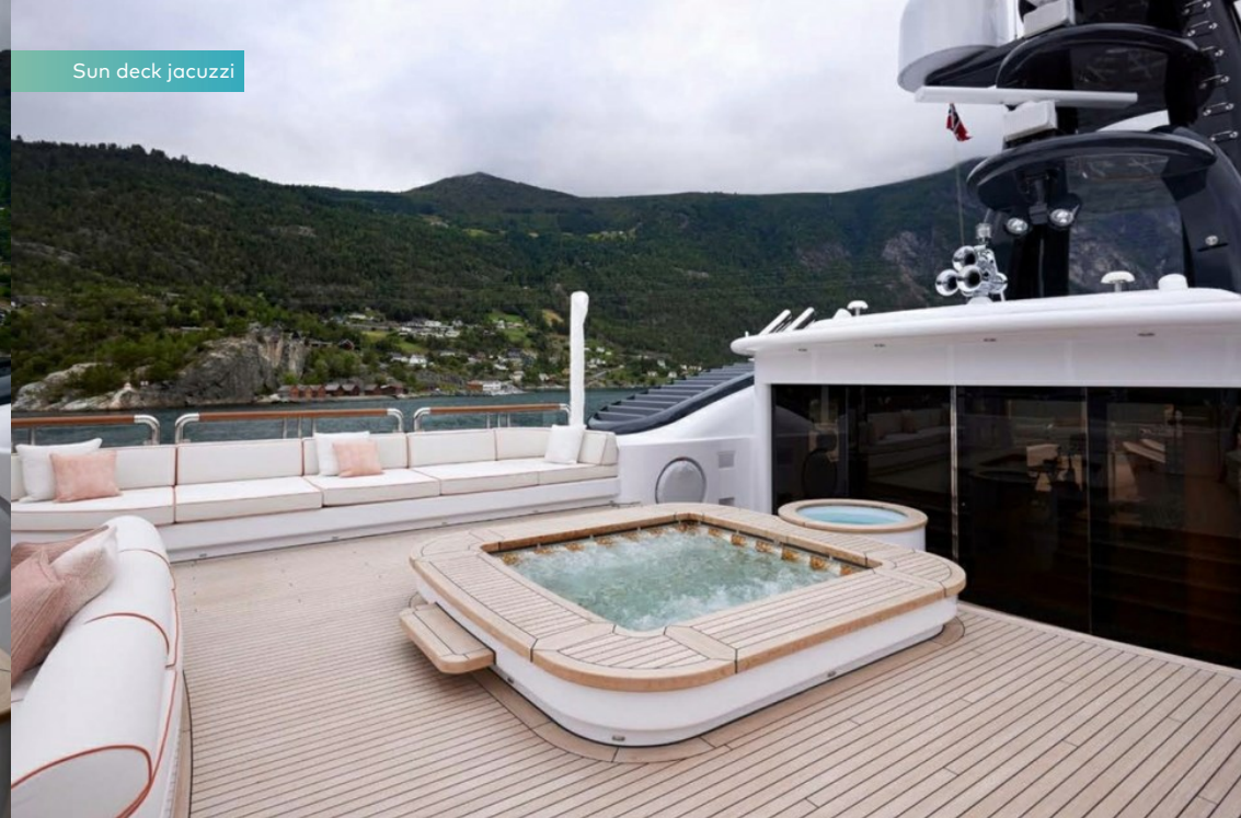
Sun deck jacuzzi