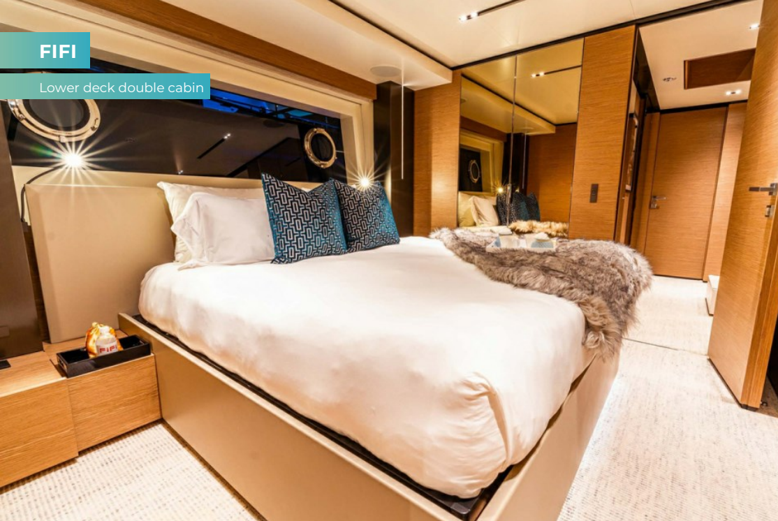
Lower deck double cabin