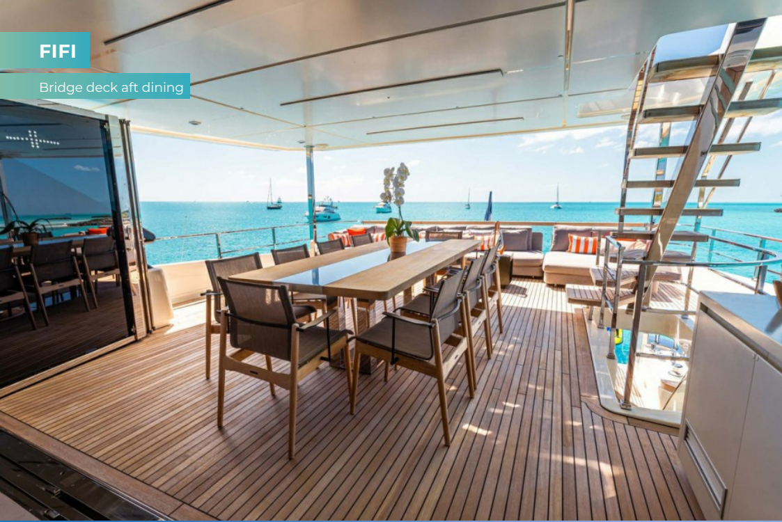
Bridge deck aft dining