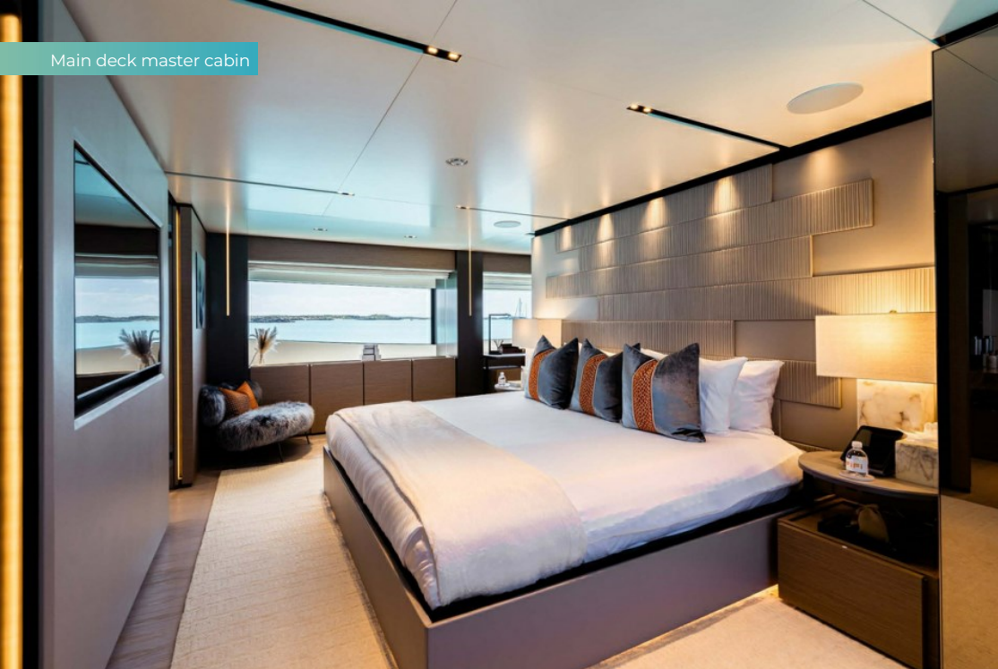
Main deck master cabin