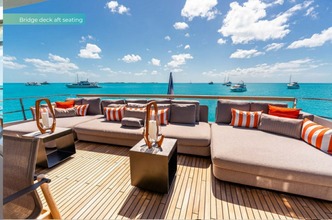
Bridge deck aft seating