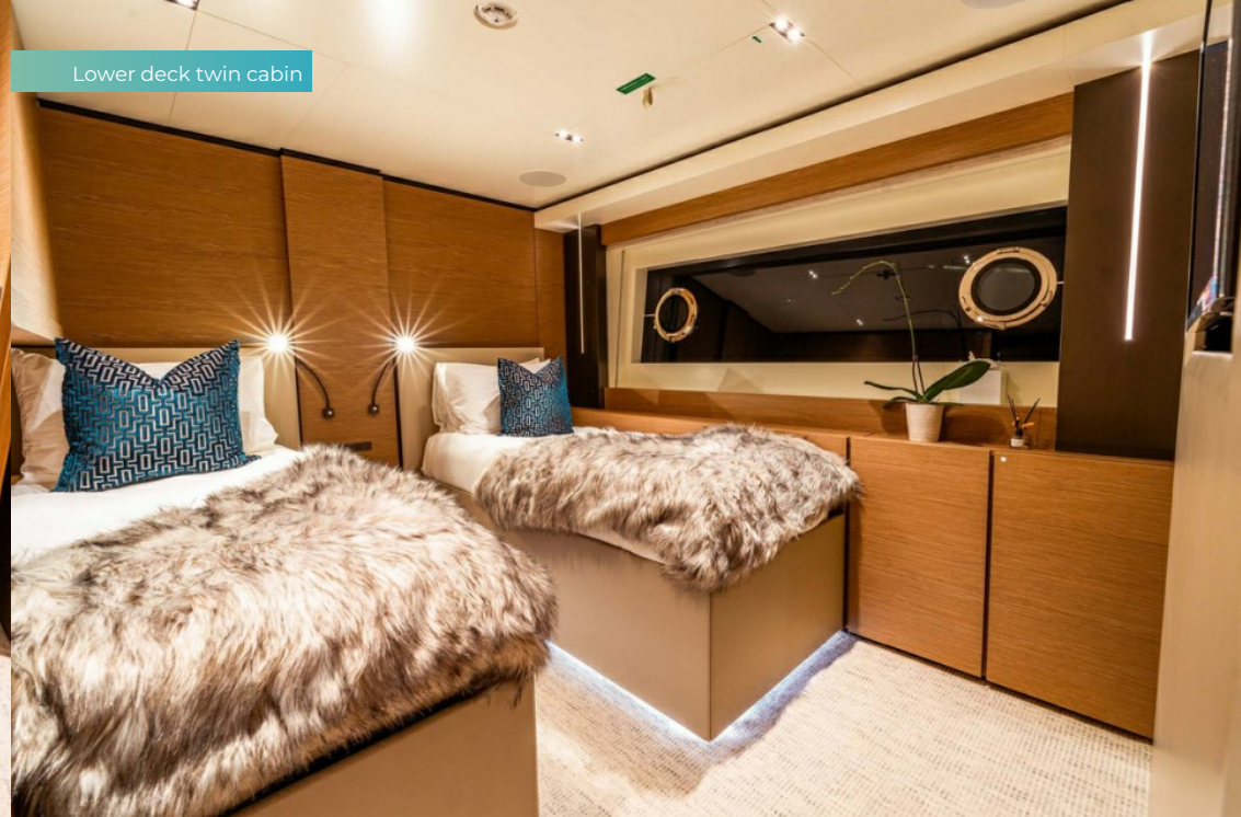
Lower deck twin cabin