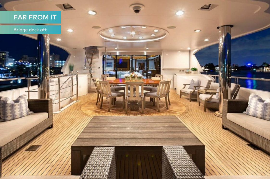
Bridge deck aft