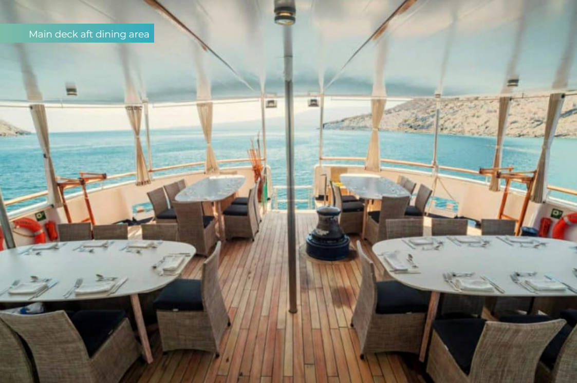
Main deck aft dining area