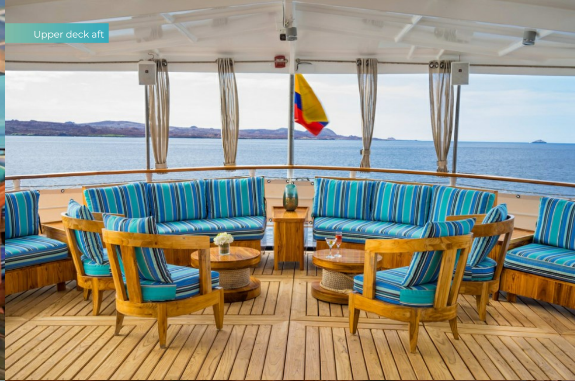
Upper deck aft