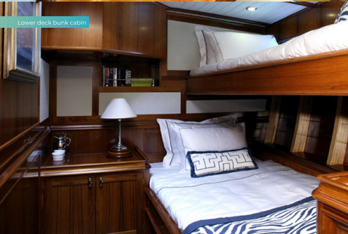
Lower deck bunk cabin