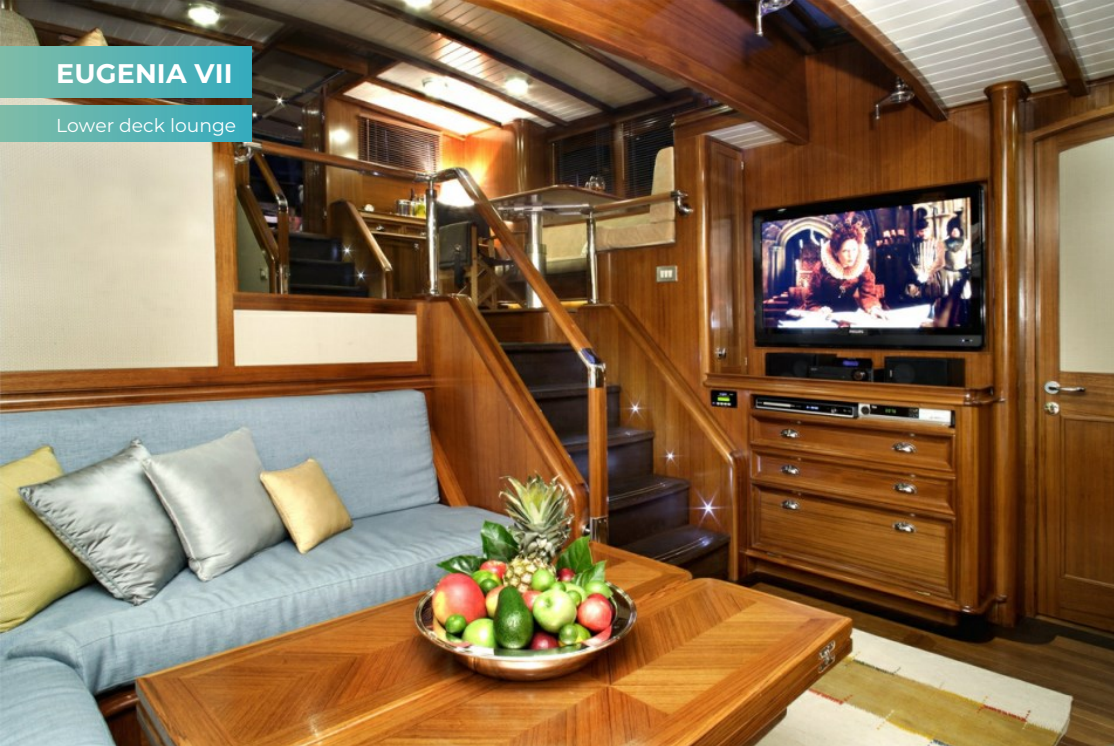
Lower deck lounge