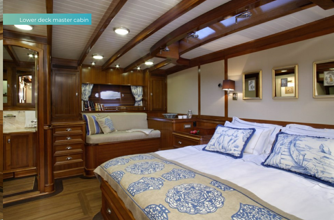
Lower deck master cabin