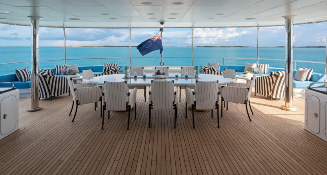
Bridge deck dining