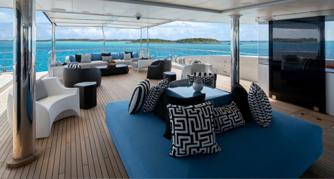
Main deck aft