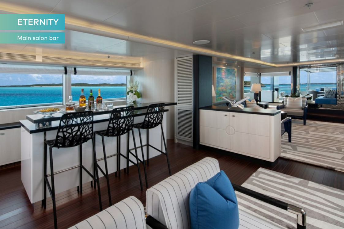
Main salon bar