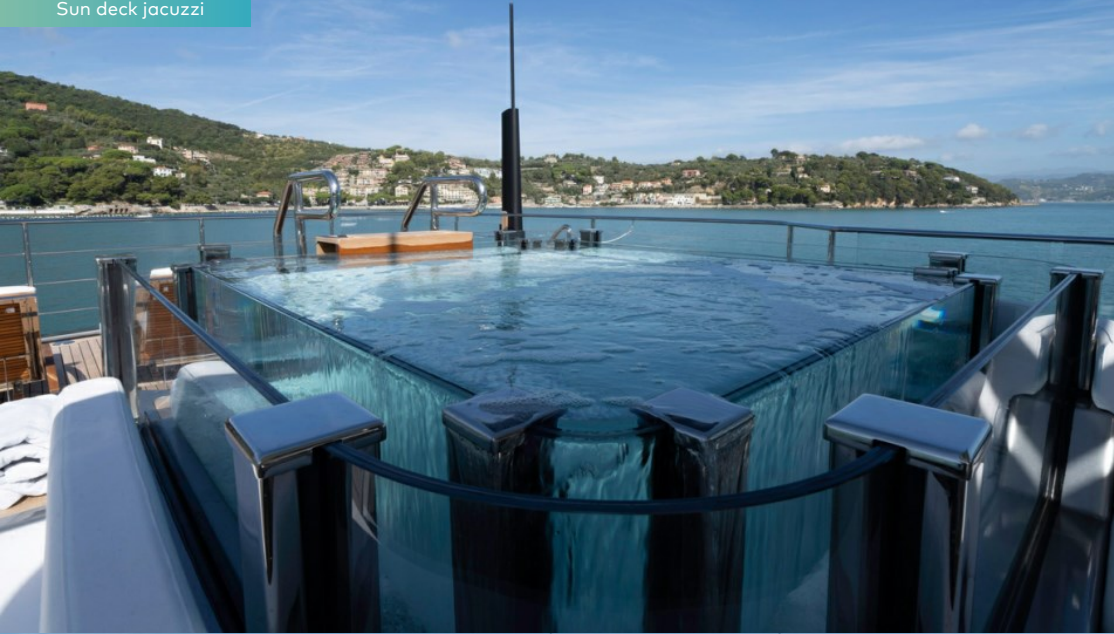
Sun deck jacuzzi