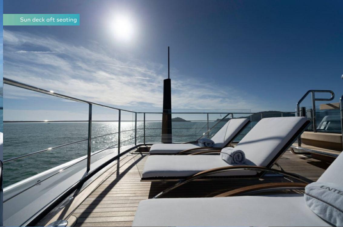
Sun deck aft seating