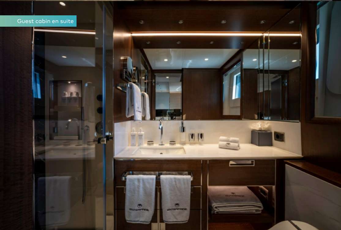
Guest cabin en suite