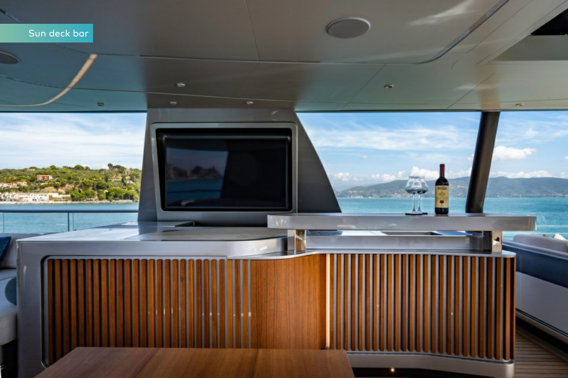
Sun deck bar