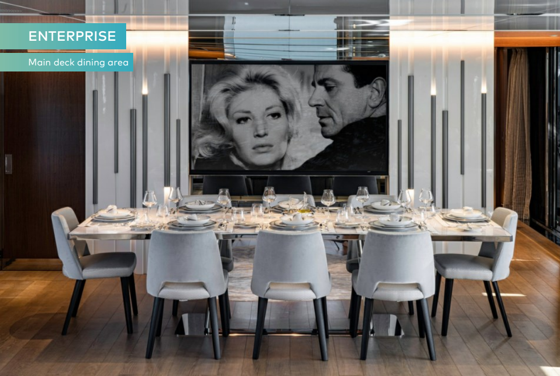
Main deck dining area