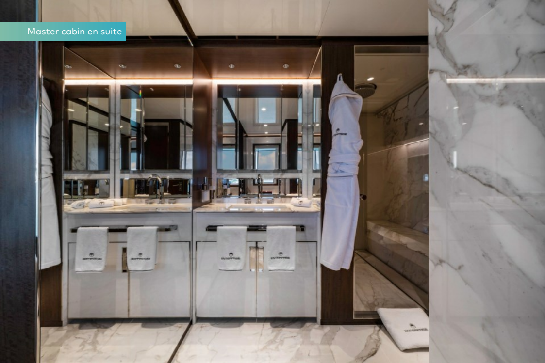
Master cabin en suite