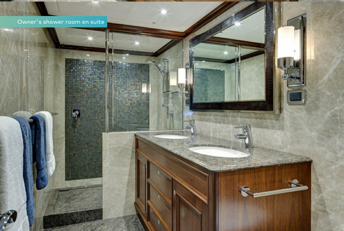
Owner's shower room en suite