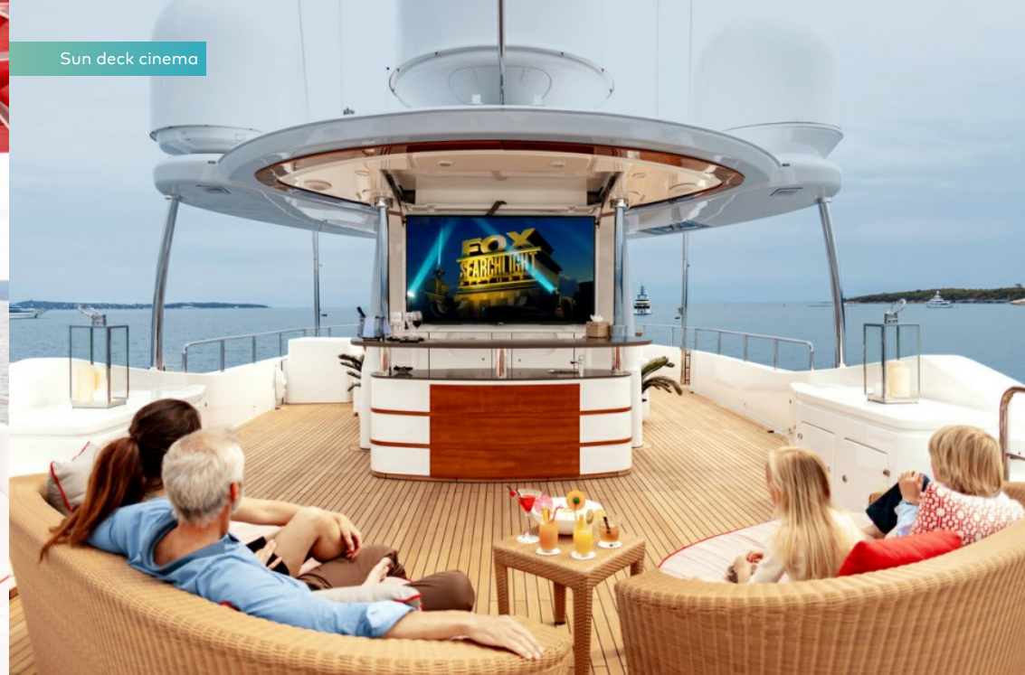
Sun deck cinema