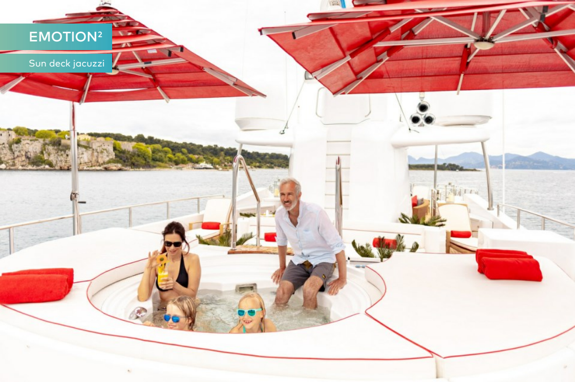
Sun deck jacuzzi