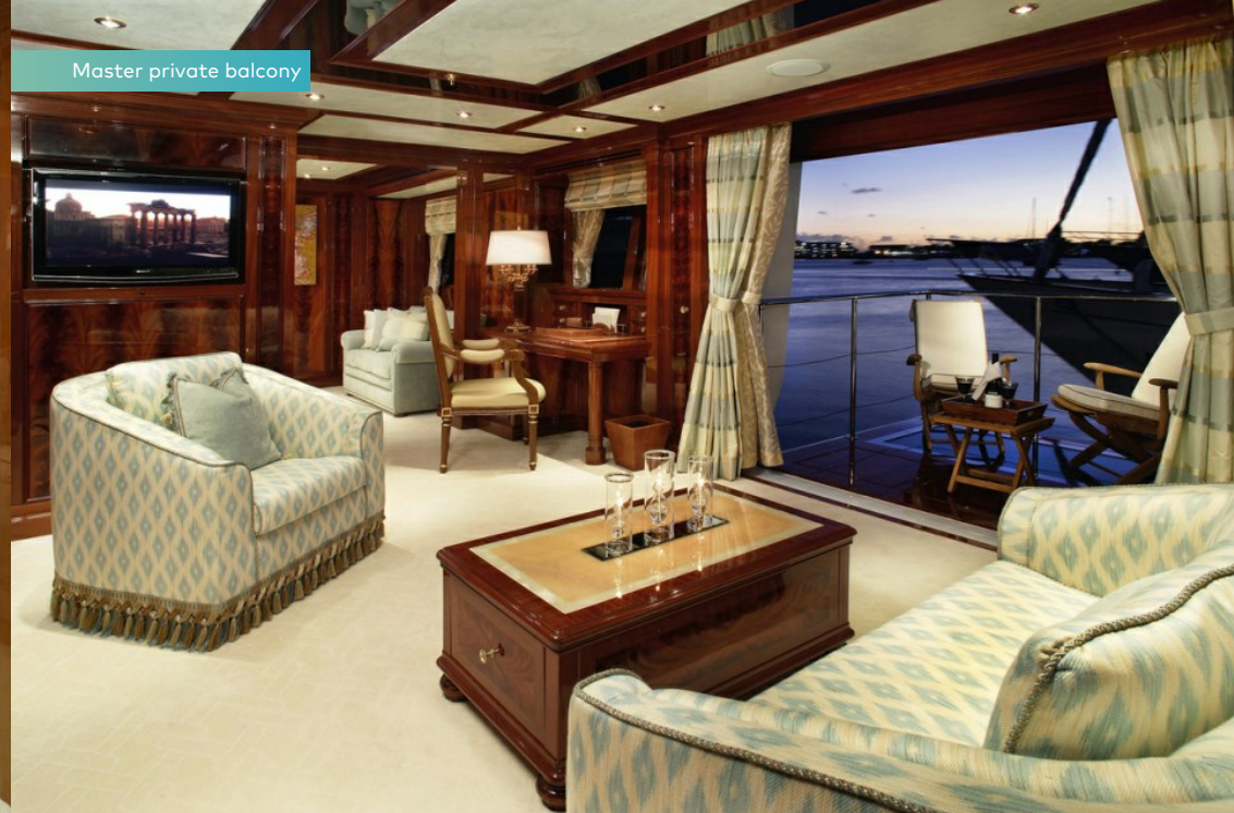
Master private balcony