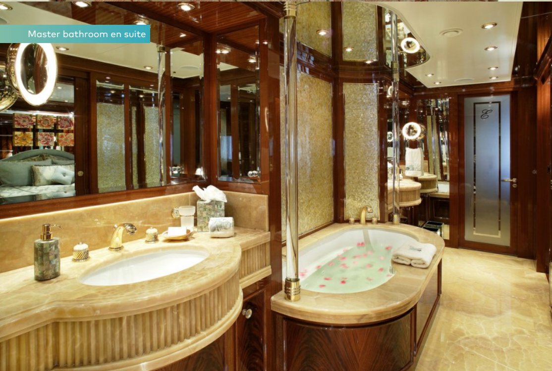
Master bathroom en suite