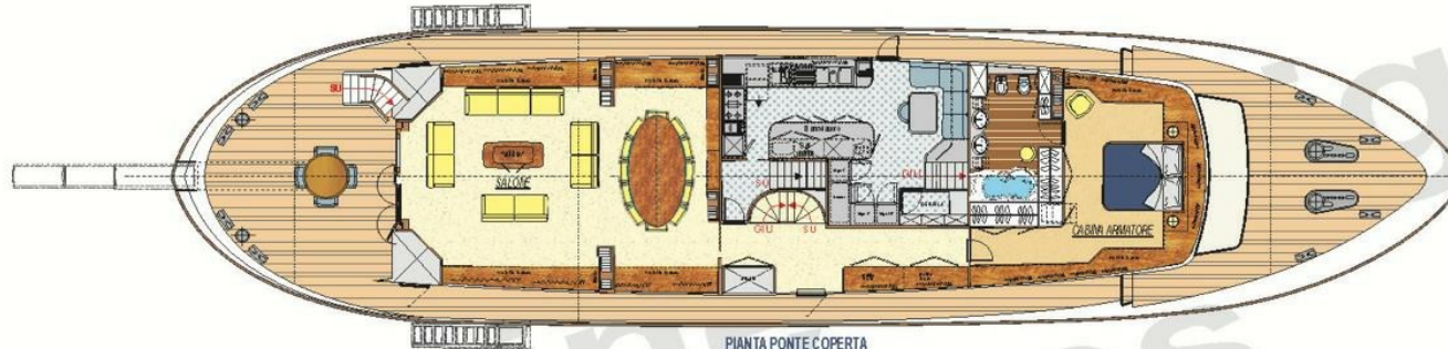
PIANTA PONTE COPERTA