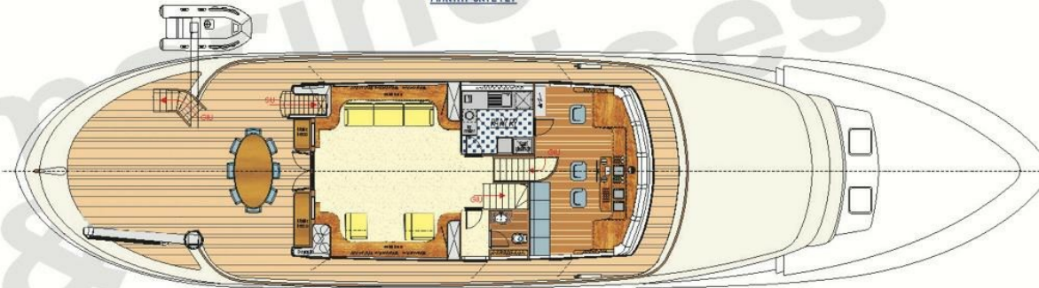
PIANTA PONTE TIMONERIA