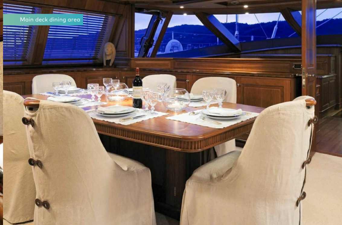
Main deck dining area