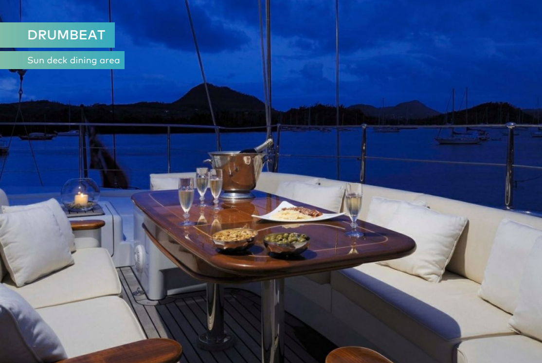
Sun deck dining area