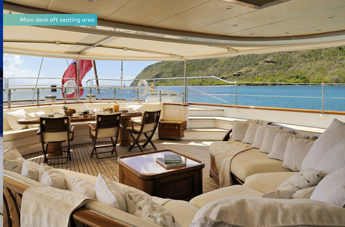
Main deck aft seating area