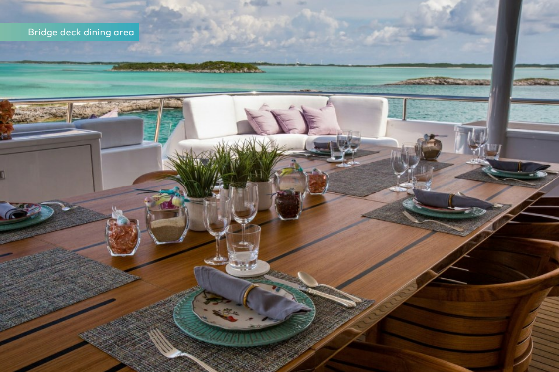
Bridge deck dining area