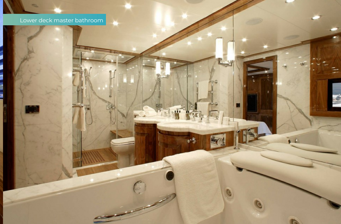
Lower deck master bathroom