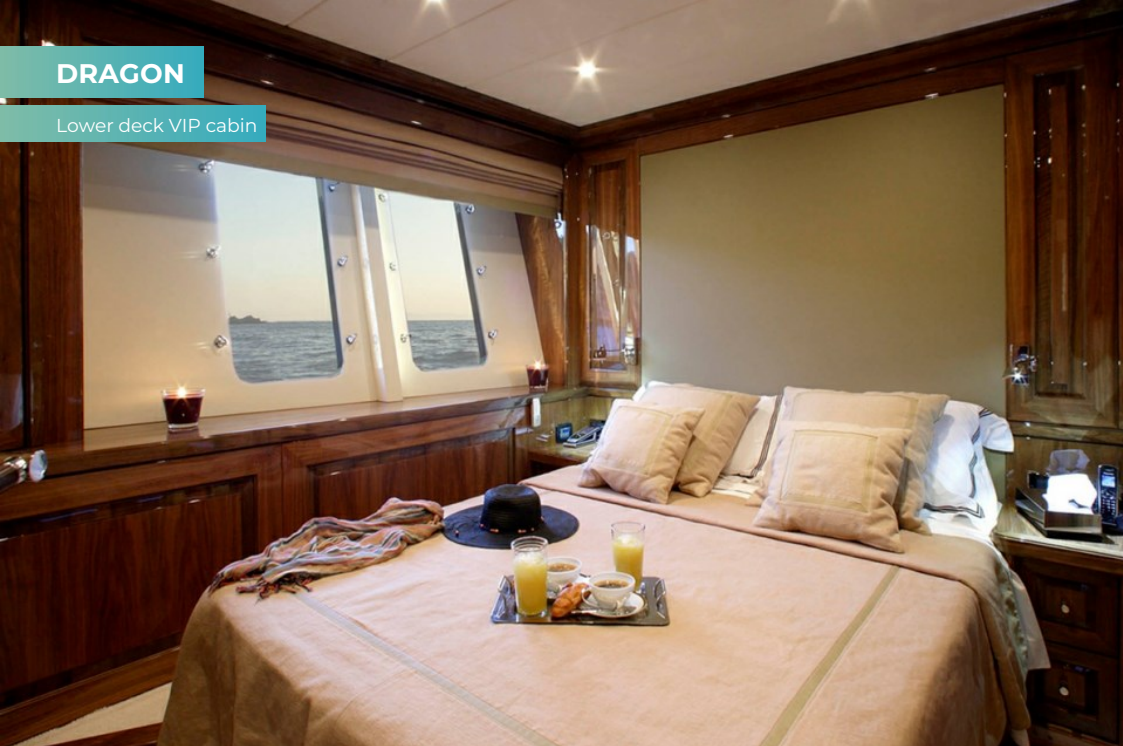
Lower deck VIP cabin