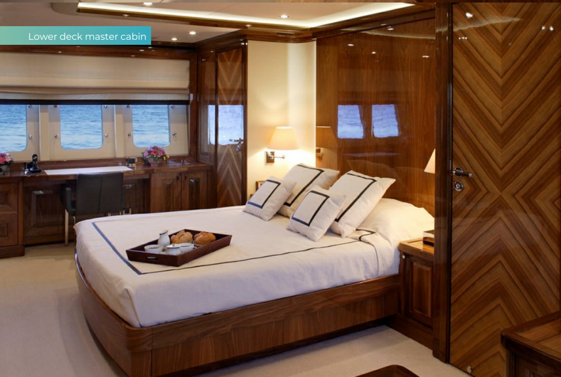
Lower deck master cabin