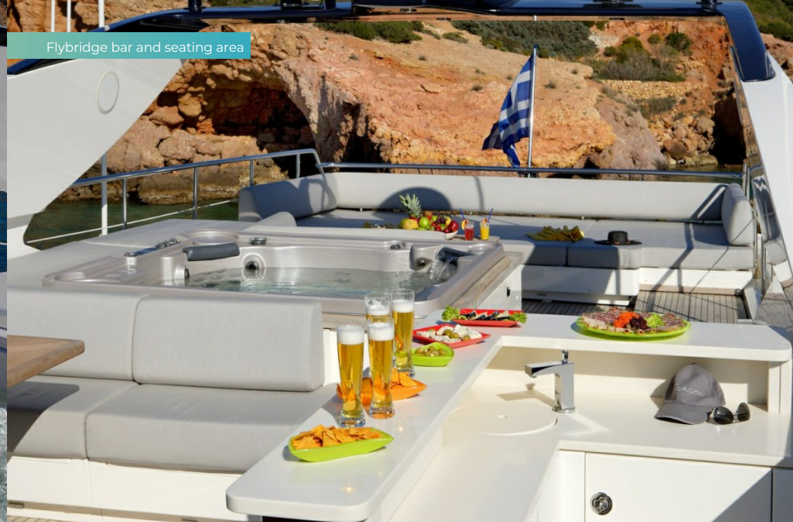
Flybridge bar and seating area