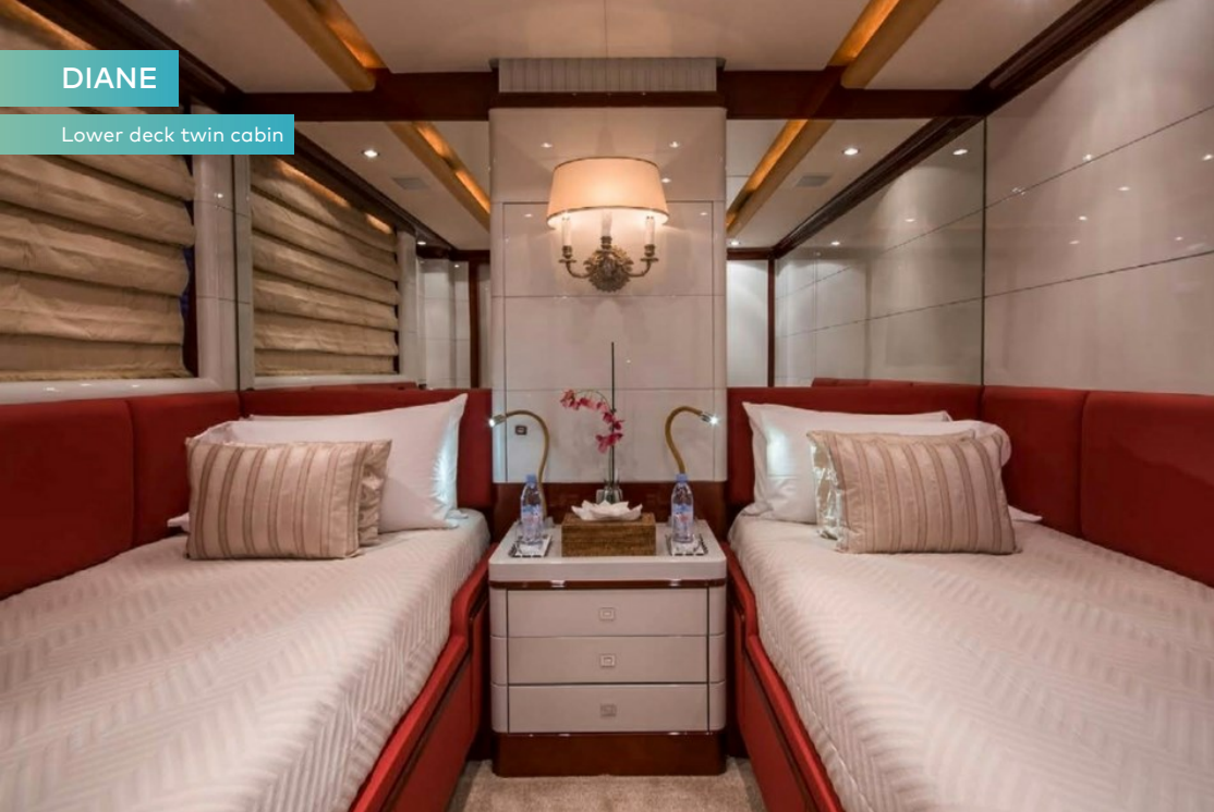
Lower deck twin cabin