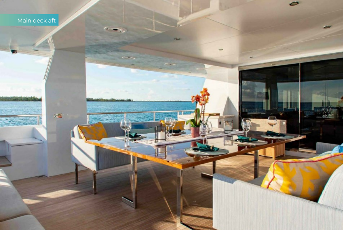
Main deck aft