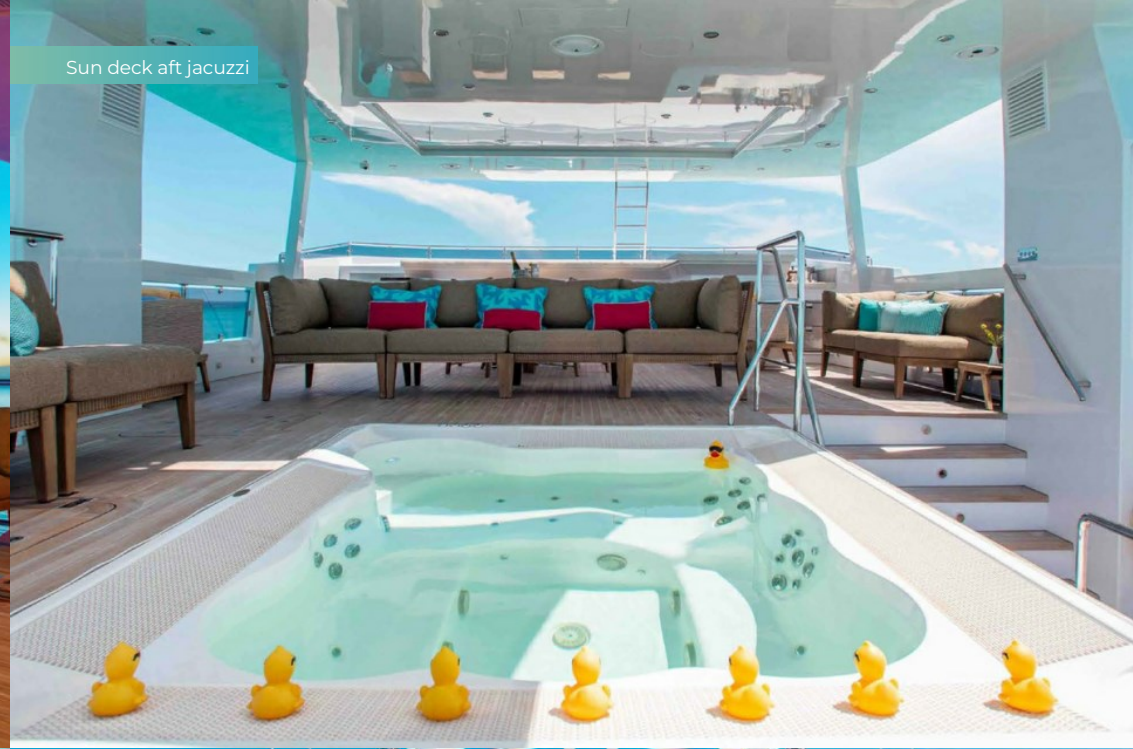
Sun deck aft jacuzzi