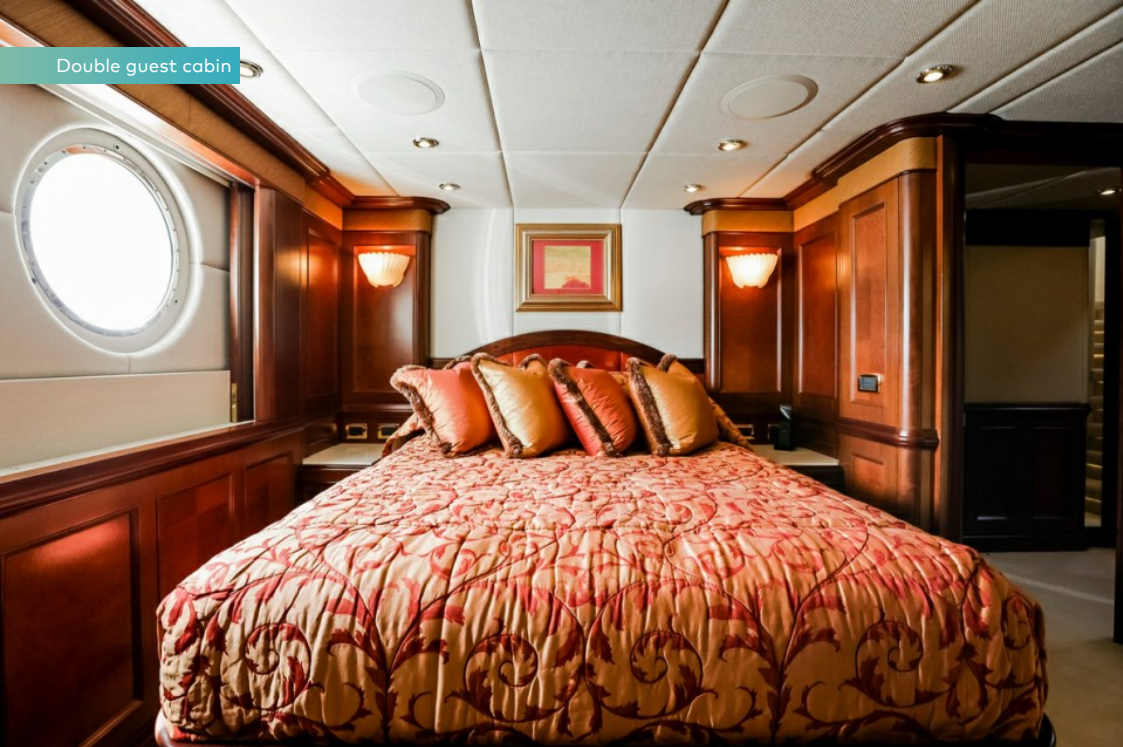
Double guest cabin