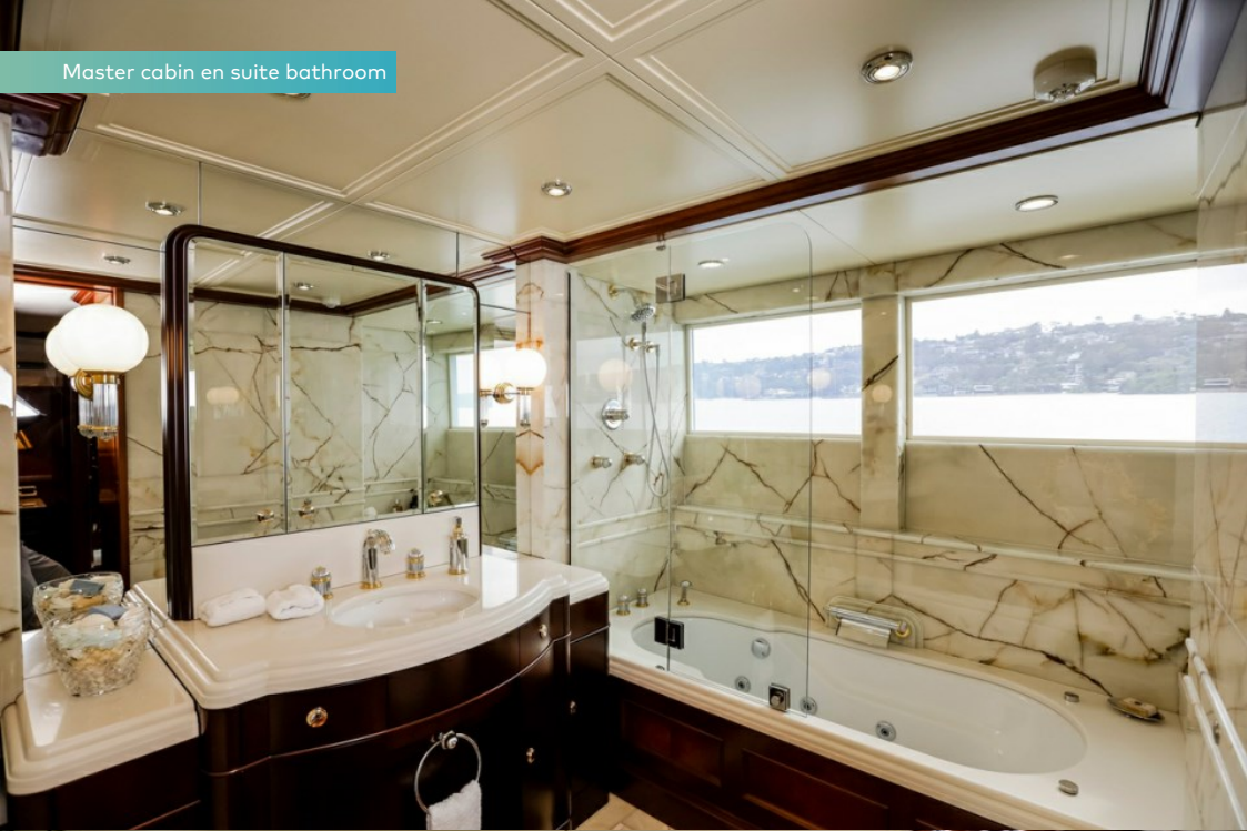
Master cabin en suite bathroom