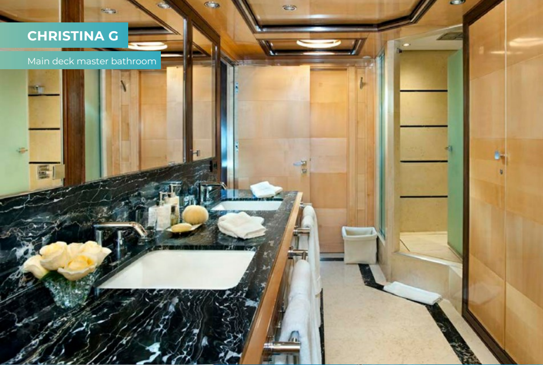
Main deck master bathroom