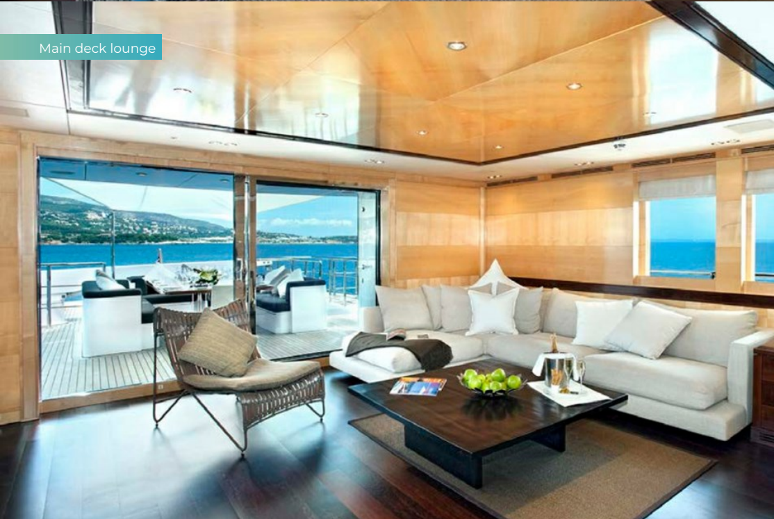
Main deck lounge