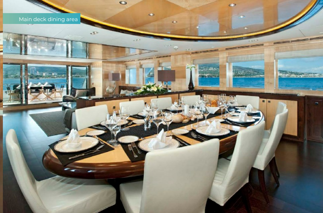
Main deck dining area