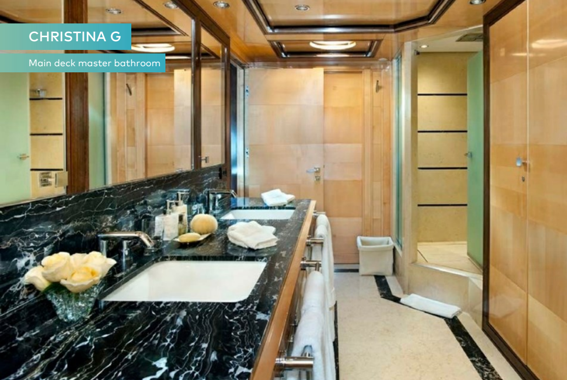
Main deck master bathroom