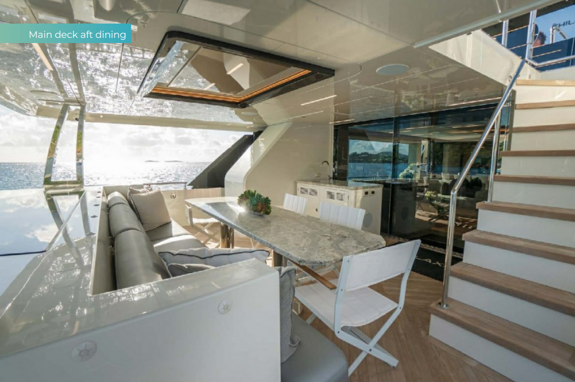
Main deck aft dining