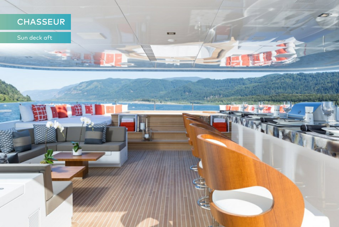
Sun deck aft