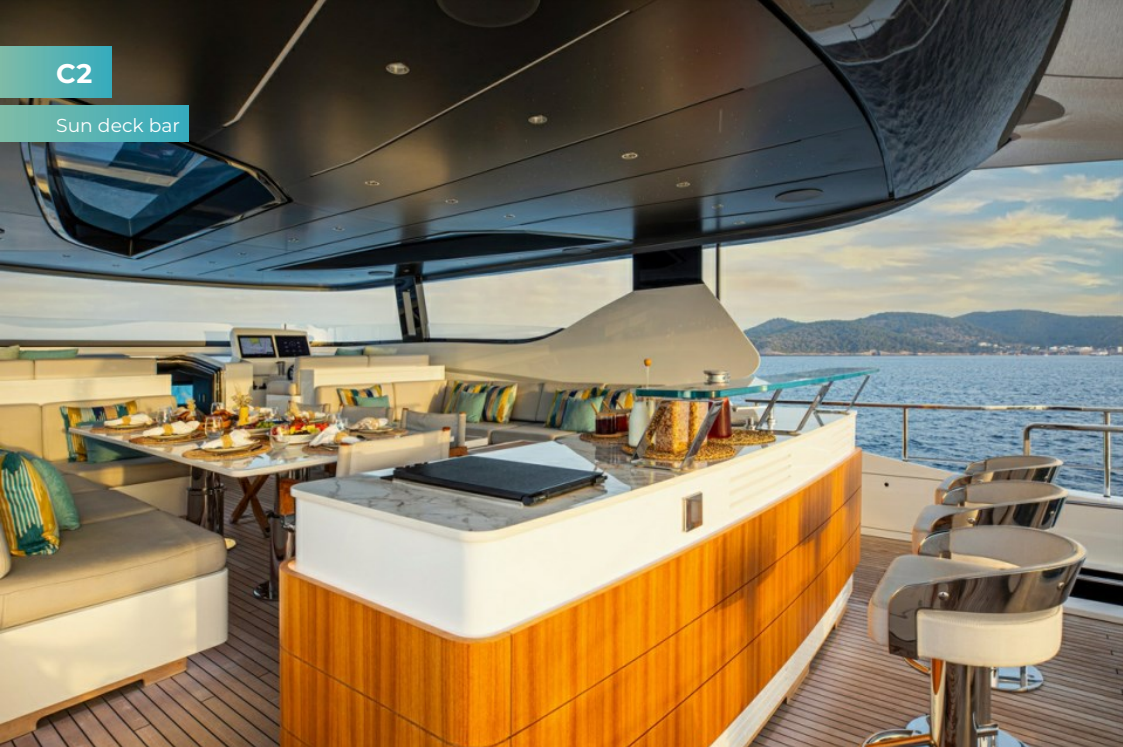
Sun deck bar