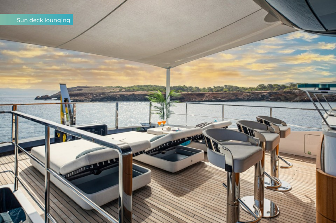
Sun deck lounging