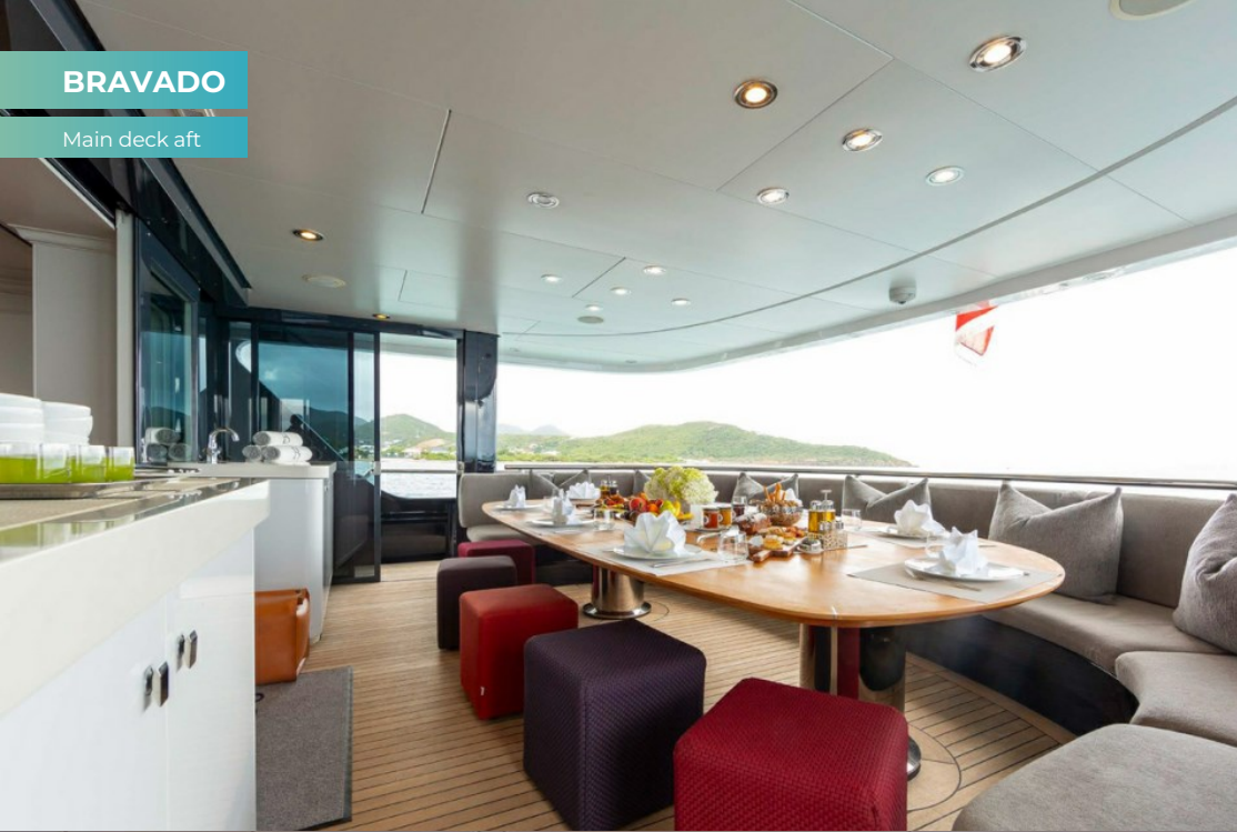
Main deck lounge