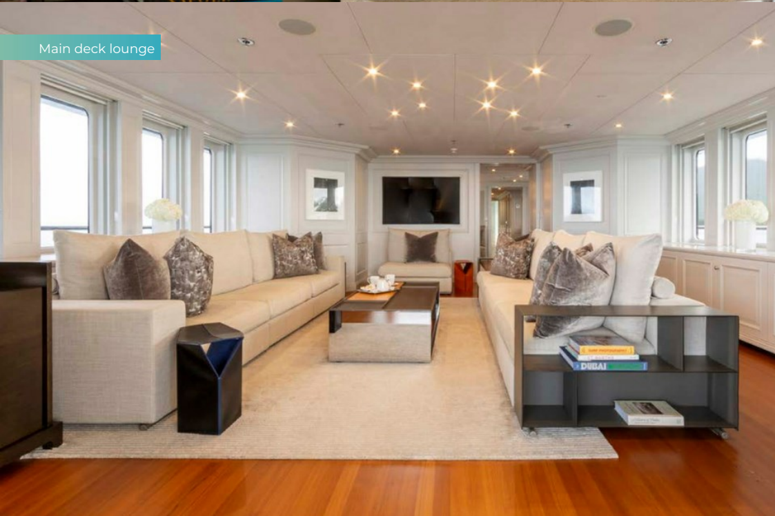
Main deck lounge