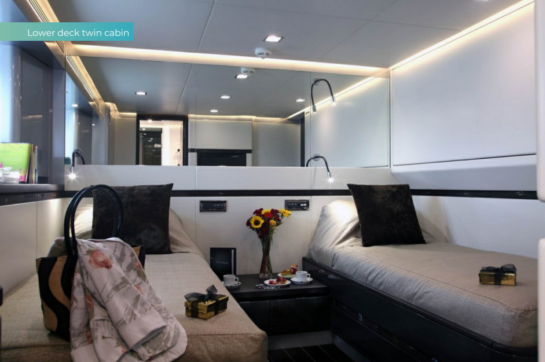
Lower deck twin cabin