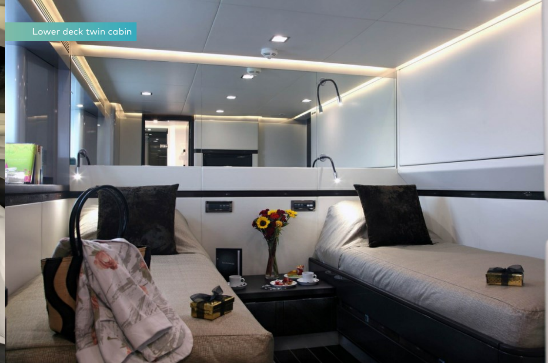
Lower deck twin cabin