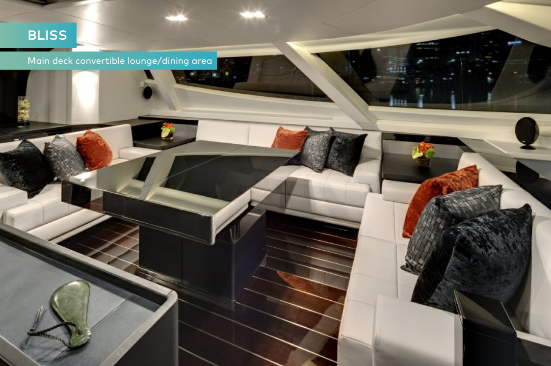
Main deck convertible lounge/dining area