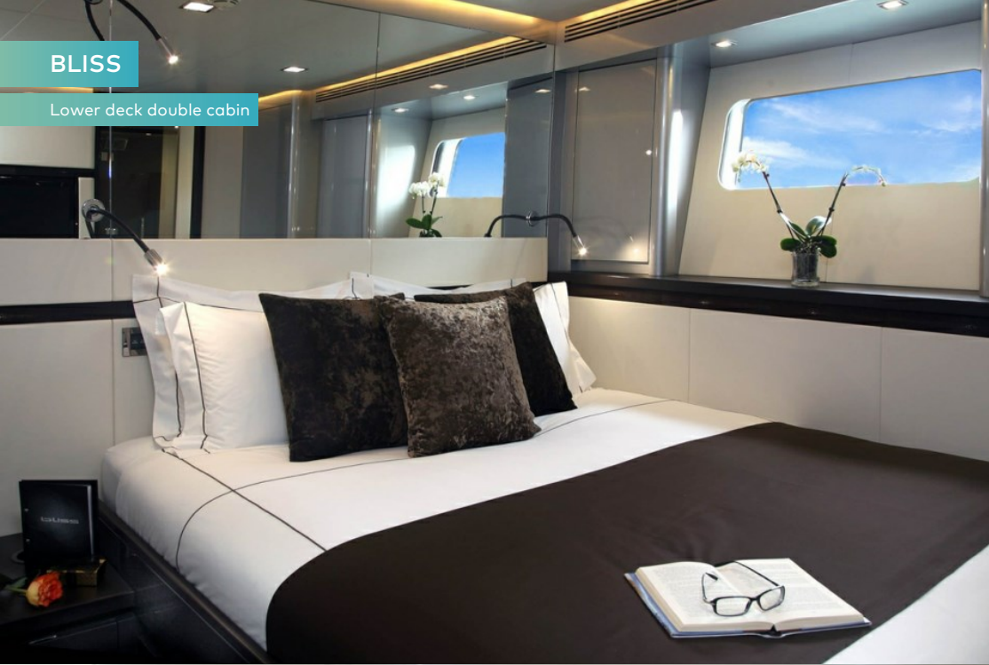
Lower deck double cabin