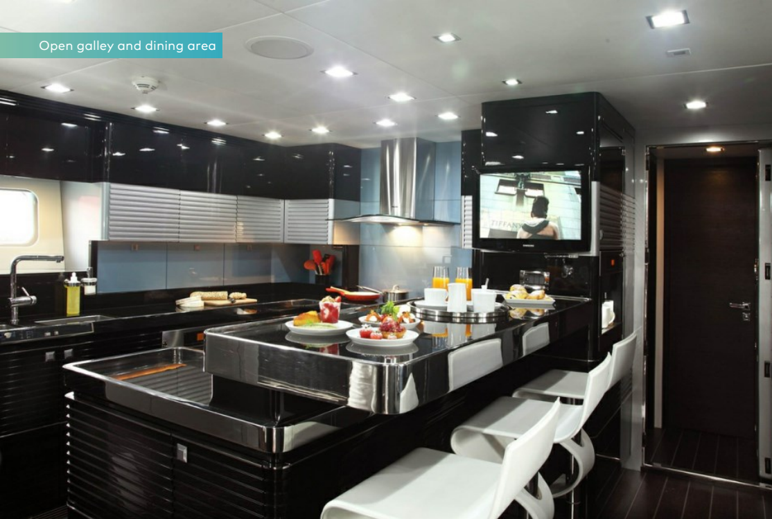
Open galley and dining area