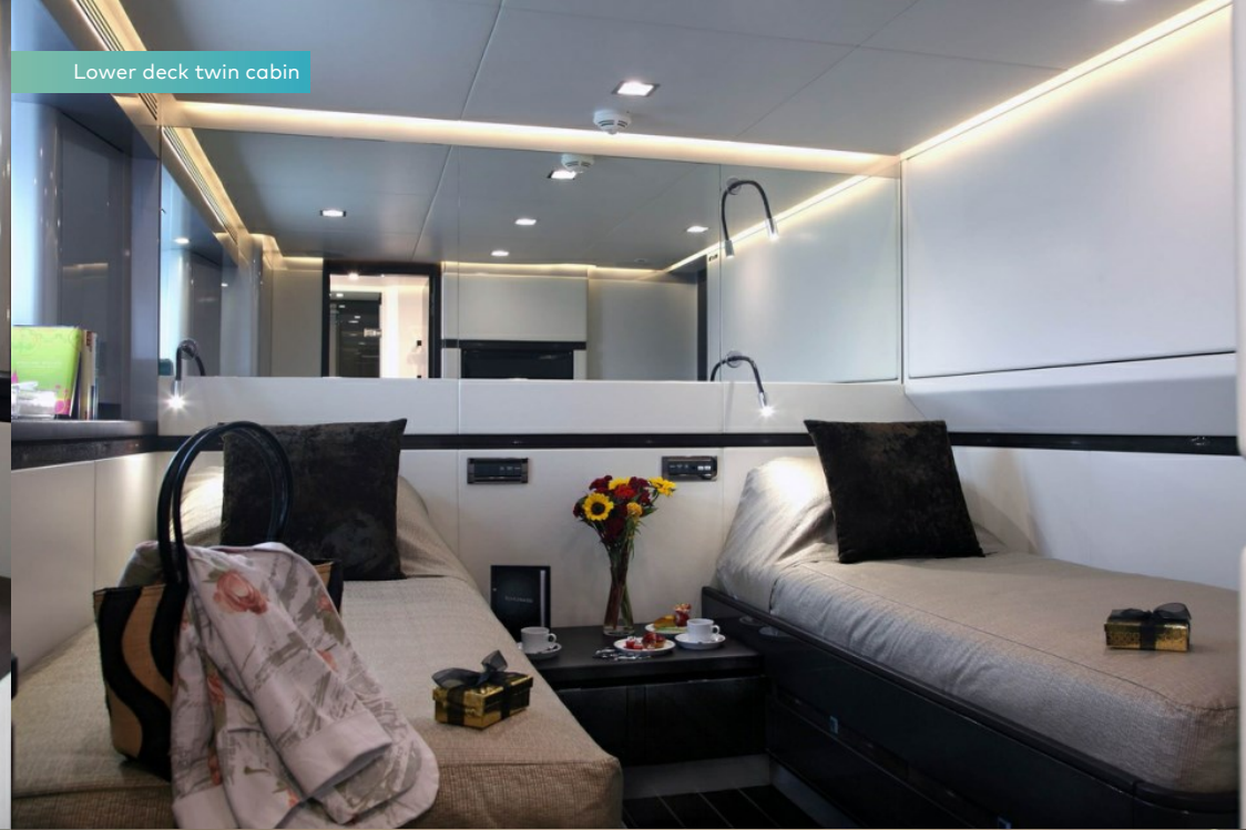
Lower deck twin cabin