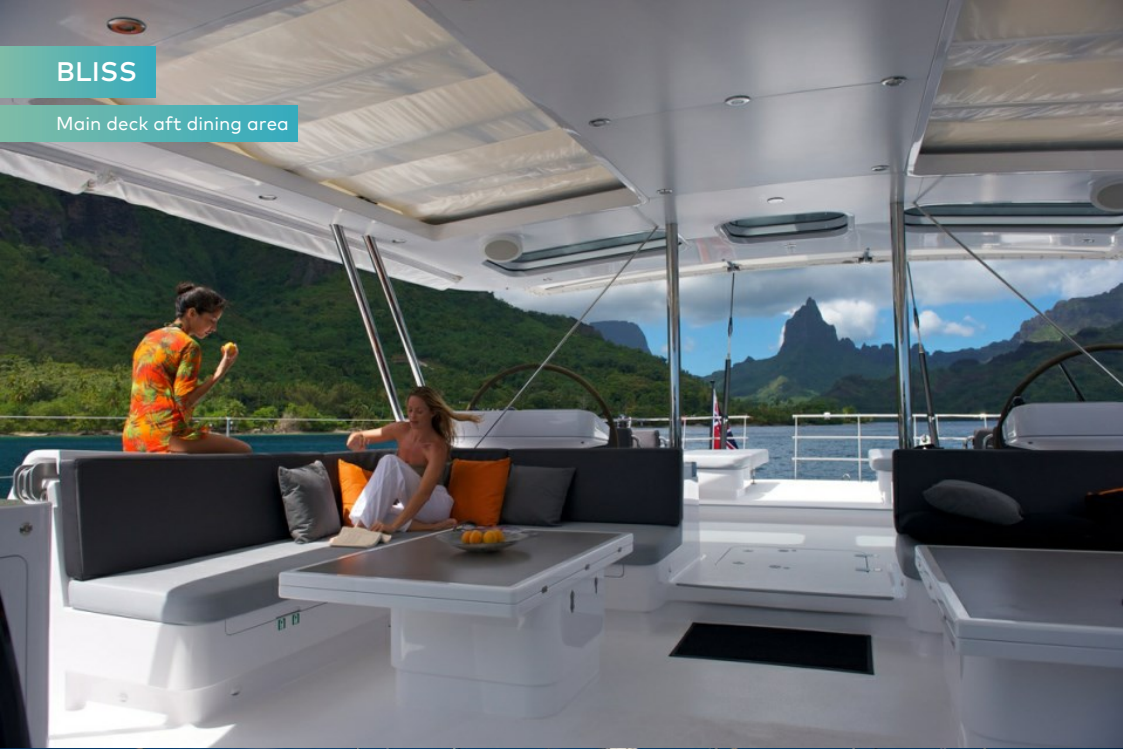
Main deck aft dining area