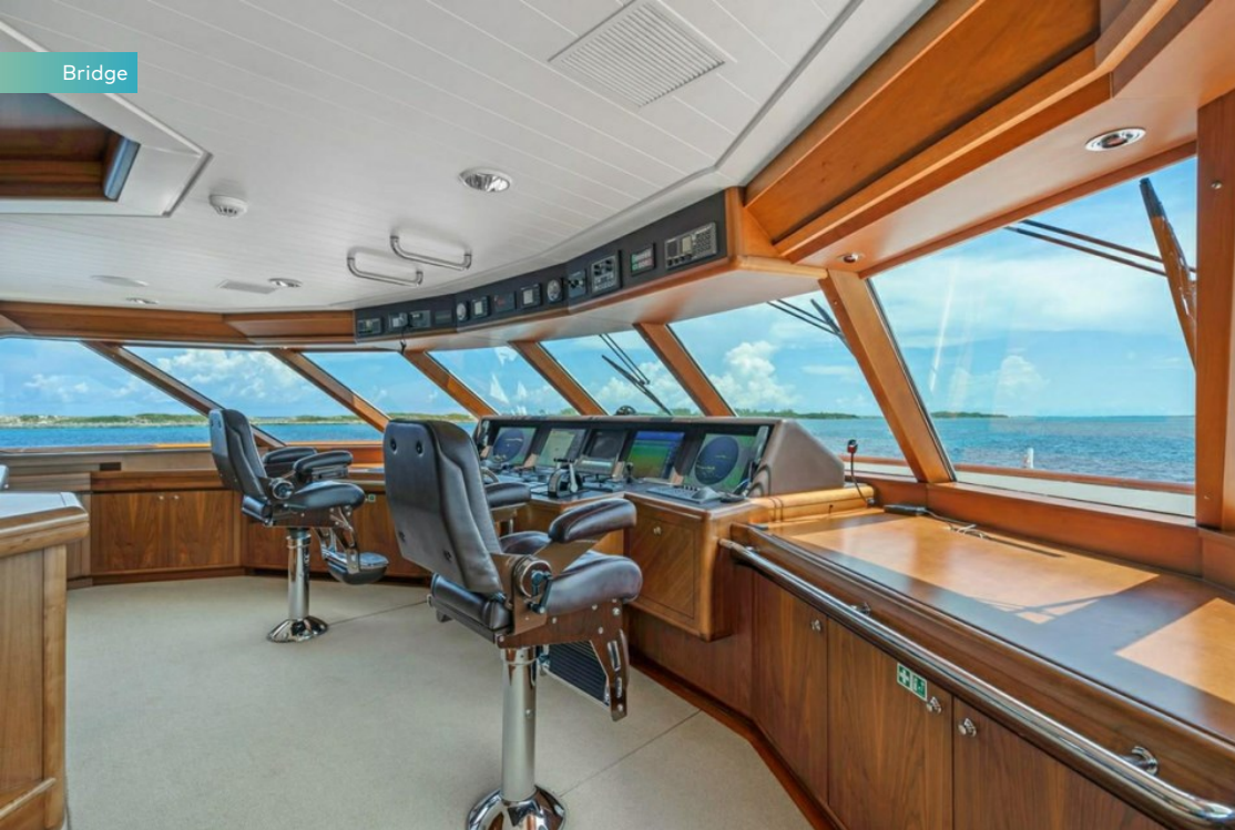
Bridge deck foyer